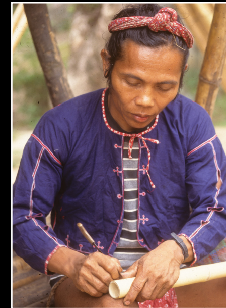
(Mansalay, 1998)

Inscribed with a knife tip on segments of bamboo, the ambahan poetry of the Hanunoo Mangyan is written in an ancient syllabary still in use today.