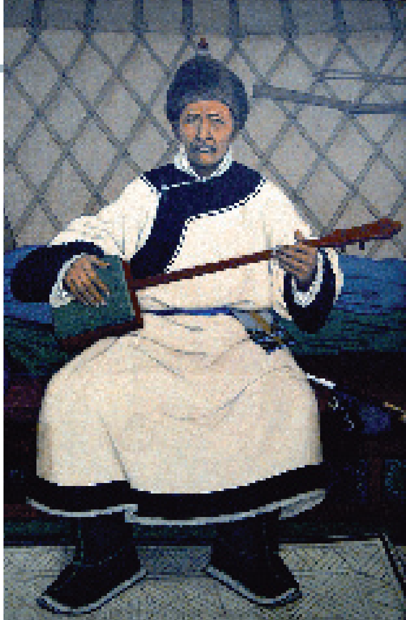
Renowned epic performer Parchin

Some epics can be recited in summer. For instance, it is forbidden to recite the epic Khan Kharangui in summer. The reason is that the hero of the epic rebelled against heaven and earth and rescued the populace from lightning. Thus, Mongo-