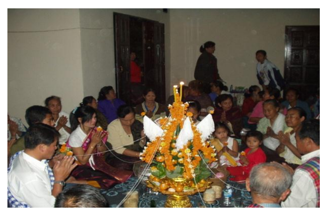
Basi soudkhouan ceremony for moving into a new house