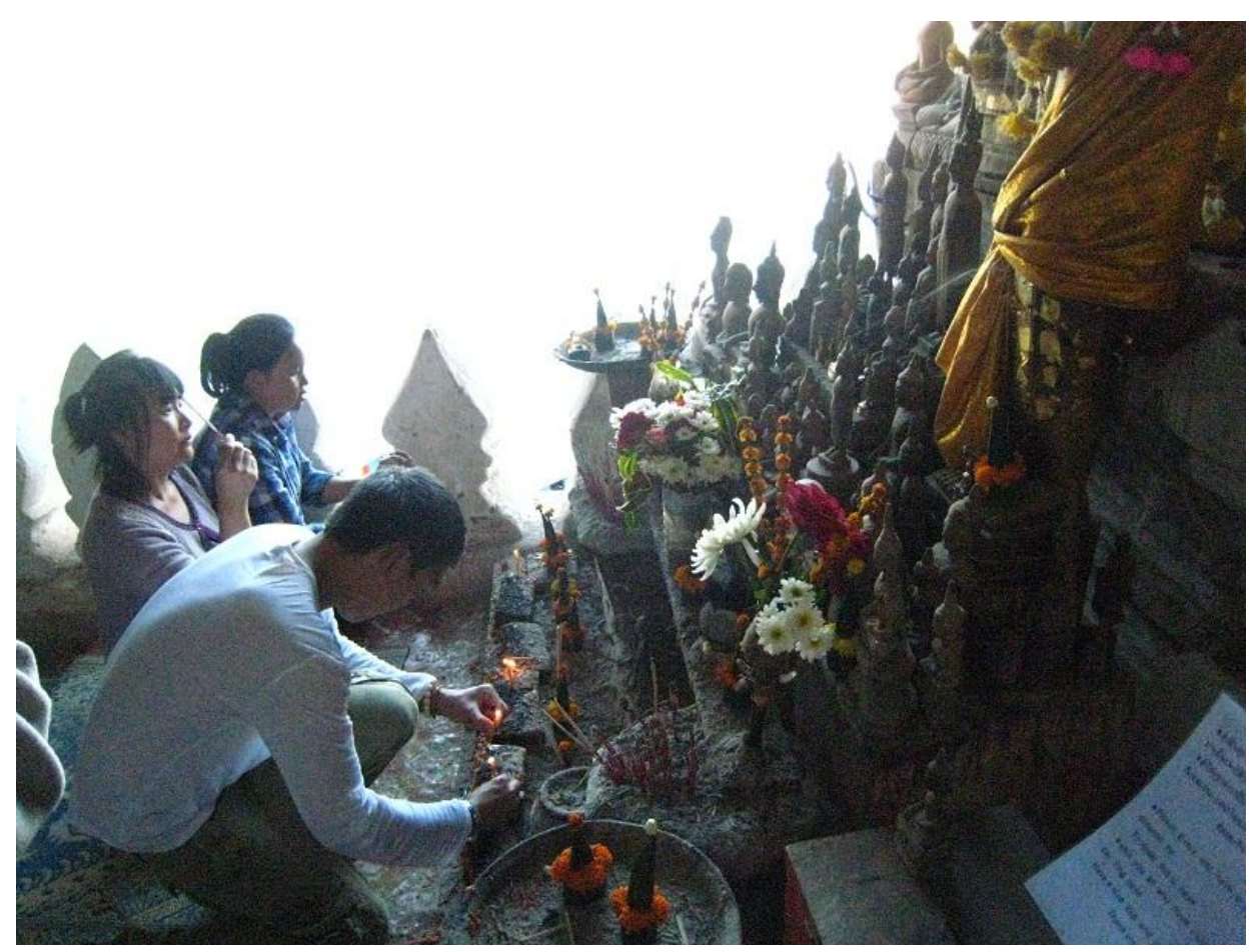
Worshippers in the Tam Ting caves