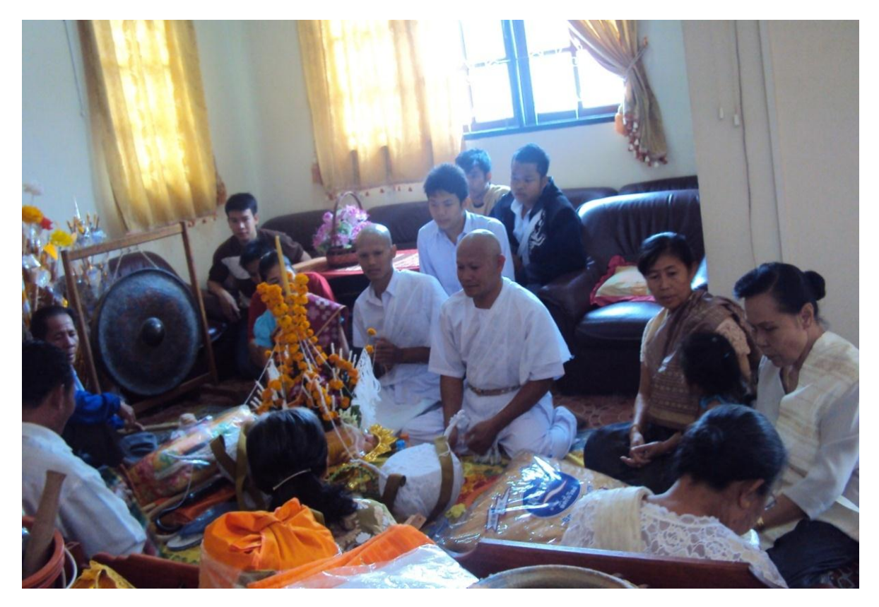
The men are wished luck with a basi before entering the priesthood