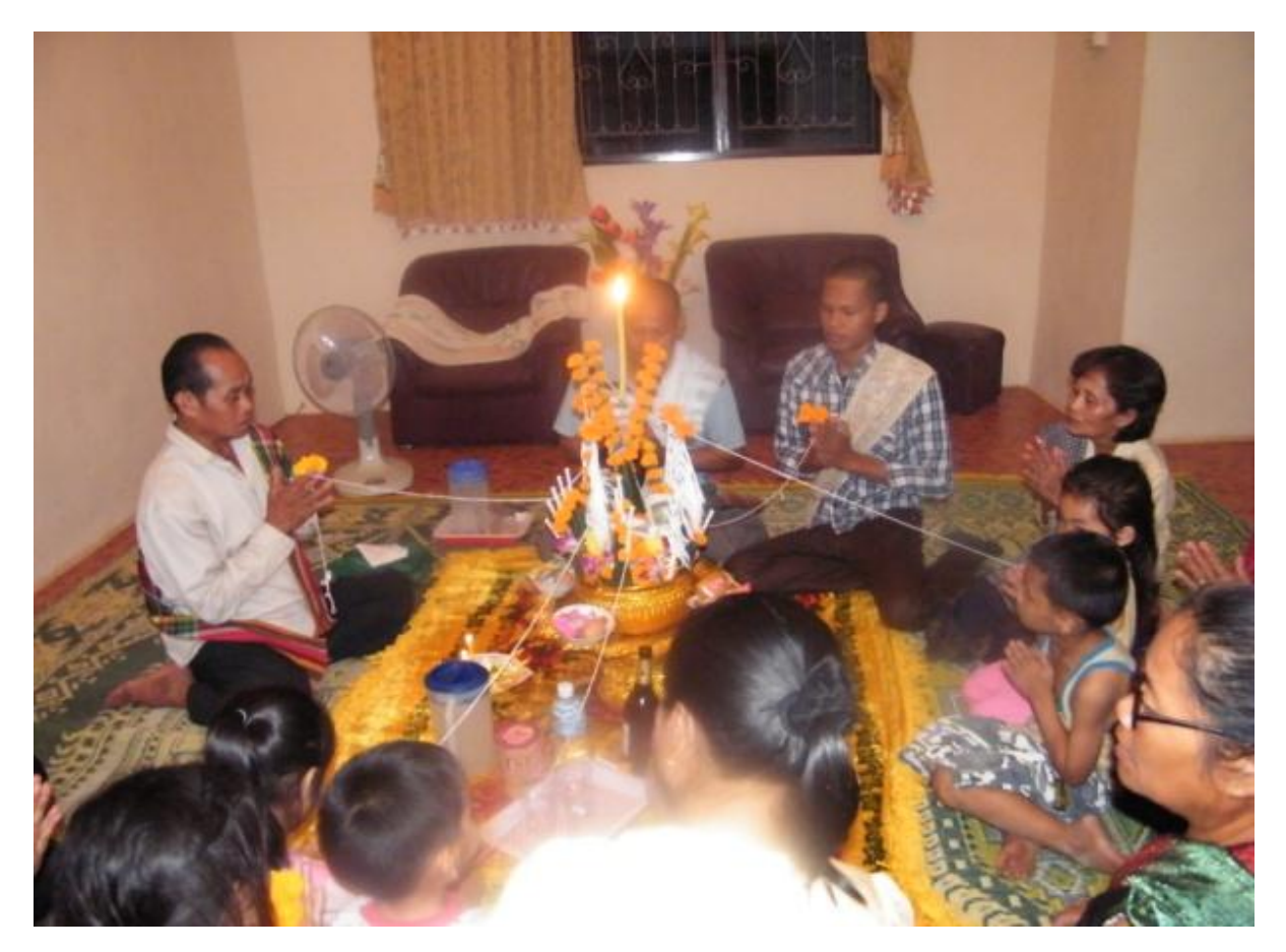
Novice monks are wished luck with a basi after leaving the priesthood