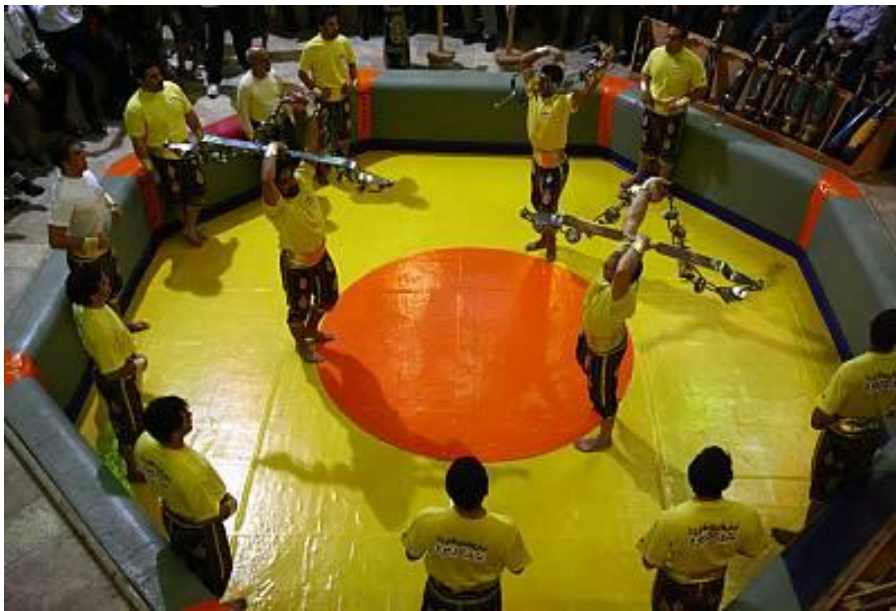
Pahlevani and Zoorkhanei Rituals