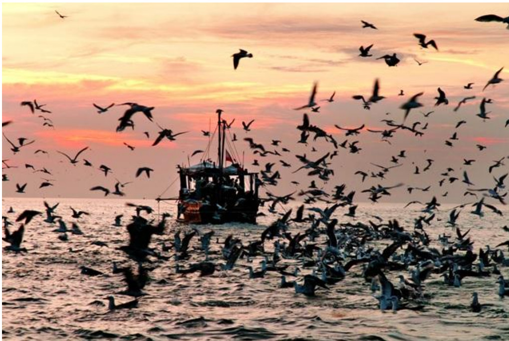
Iranian traditional Lenj Boat sailing in the Persian Gulf