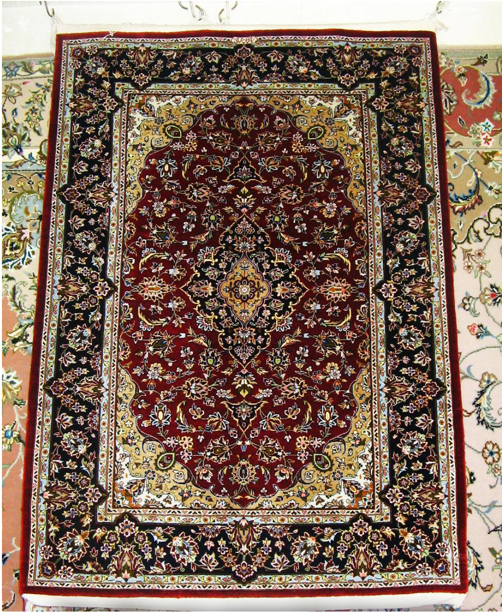
Kashan Carpet (Woven carpet in bazaar)