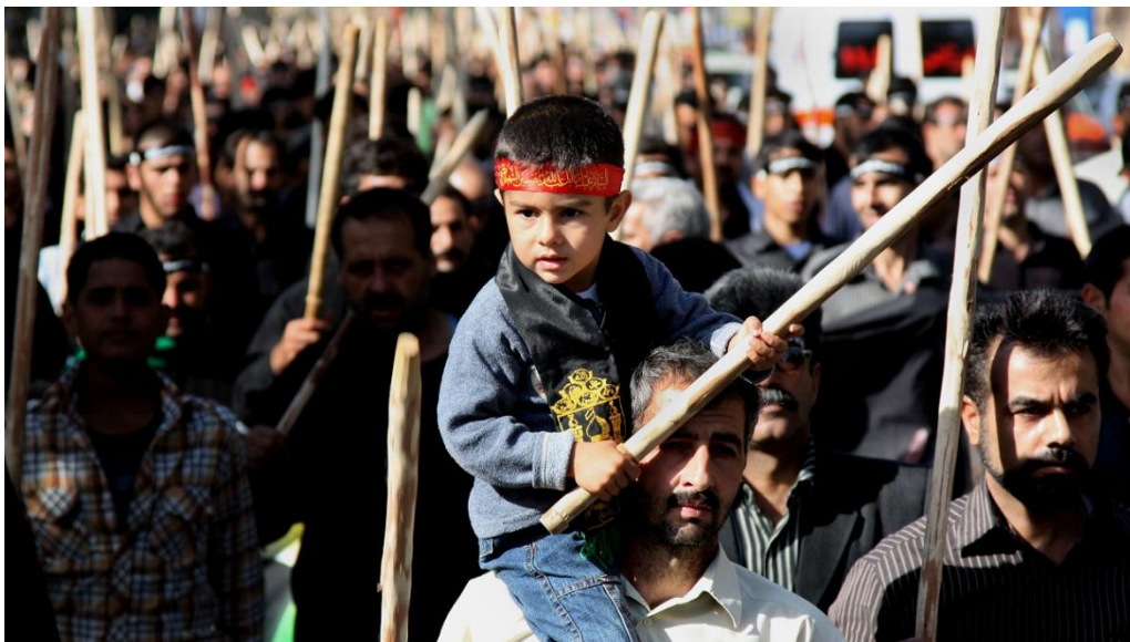
Qalishuyan-e Mashhad-e Ardehal