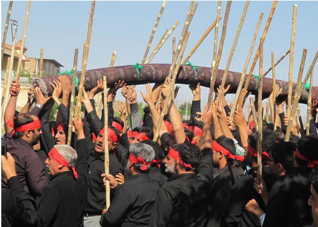
Qalishuyan-e Mashhad-e Ardehal (The sacred carpet carried to be washed with rinsing sticks)