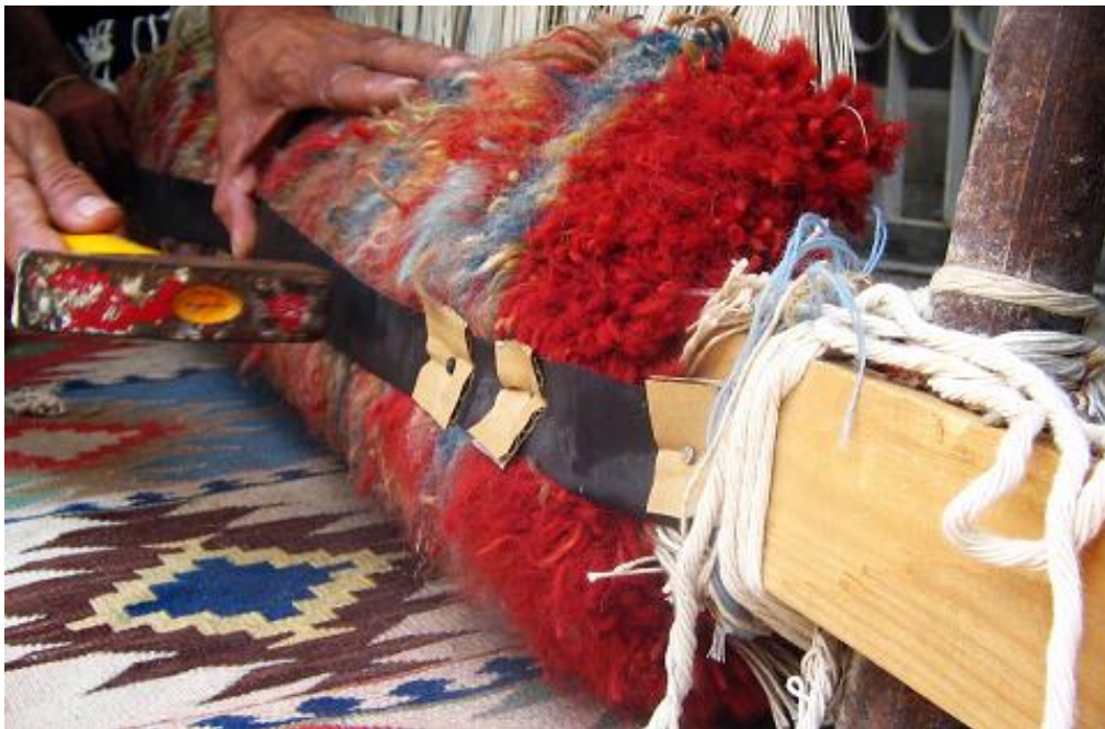
Kashan Carpet (Uninstalling the half-woven carpet)