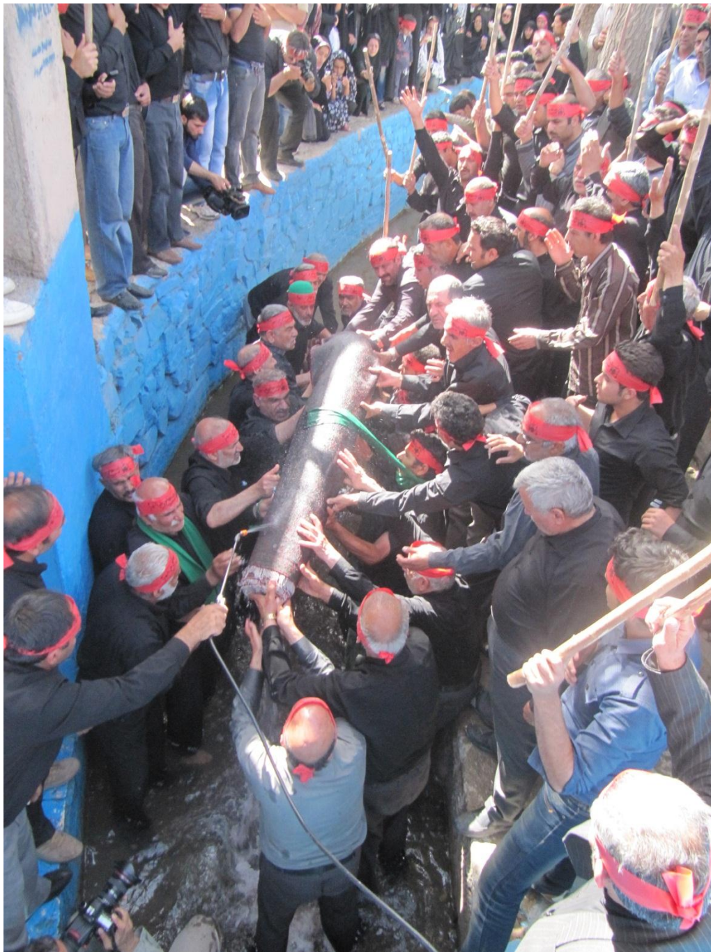
Qalishuyan-e Mashhad-e Ardehal (Sacred carpet being washed)