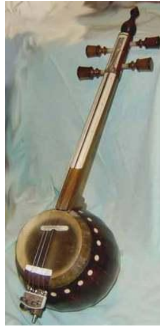
Kamanche, traditional Iranian fiddler