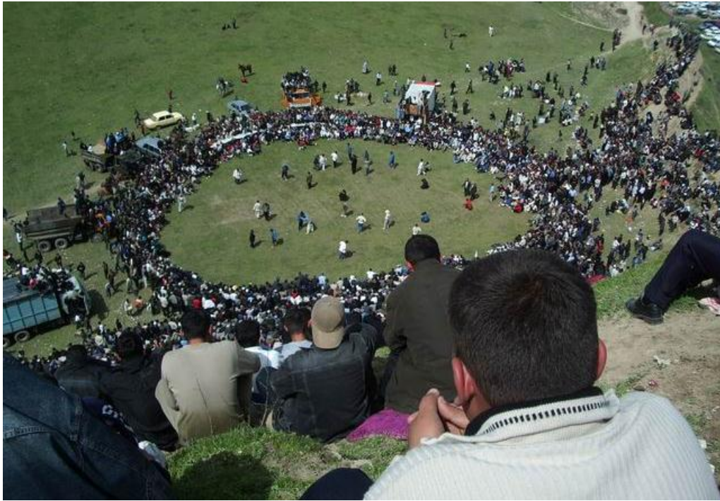
Nowrouz picnic on the 13th day of the holidays