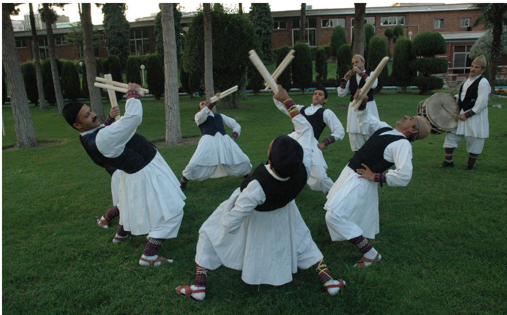
Birjandi Dance, South-east Iran (Southern Khorasan)