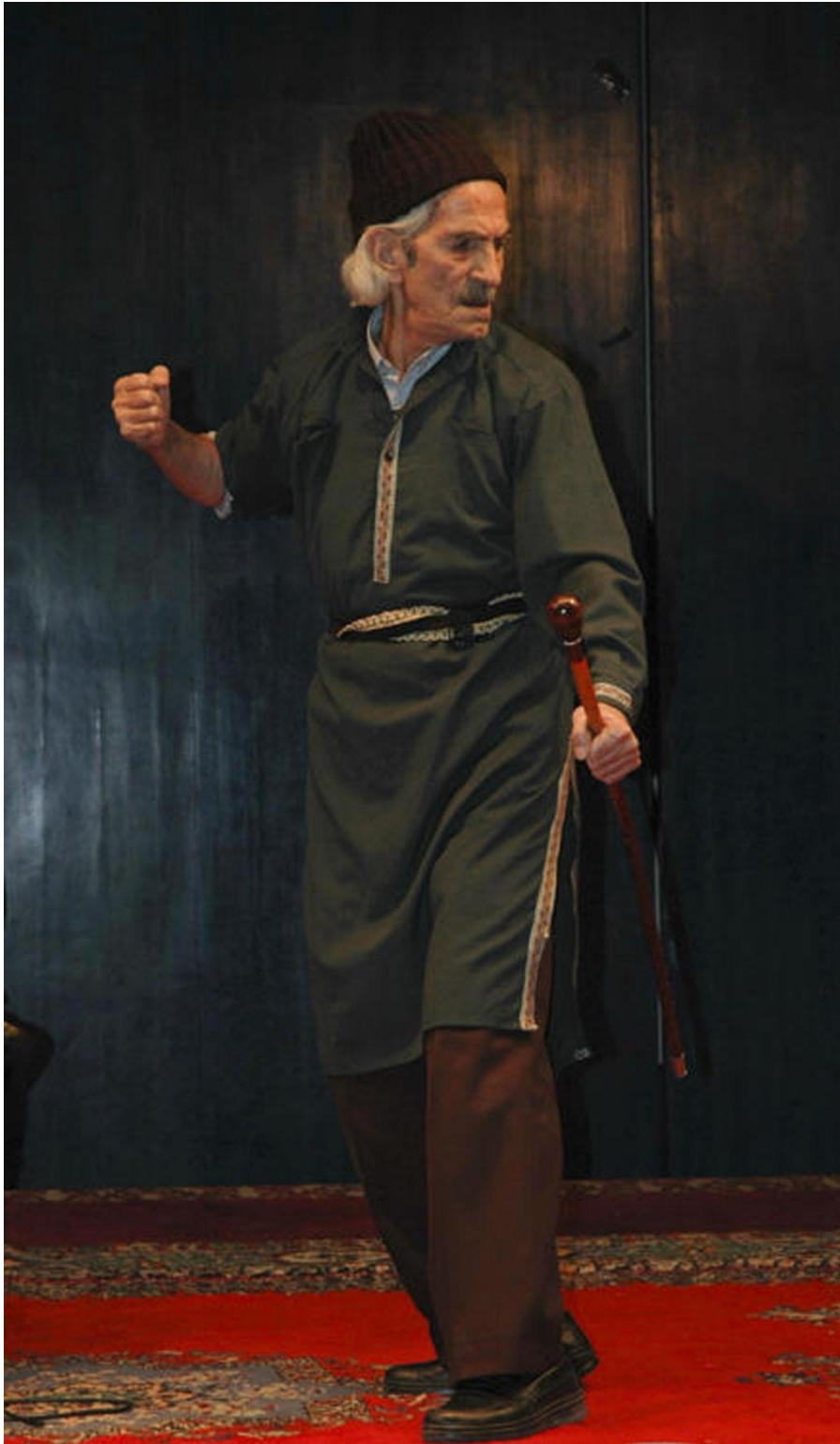
Naqqali, Iranian Dramatic Story-telling