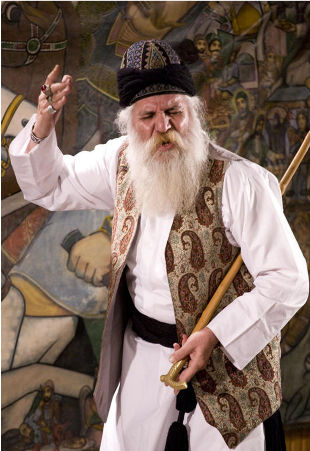
Naqqali, Iranian Dramatic Story-telling