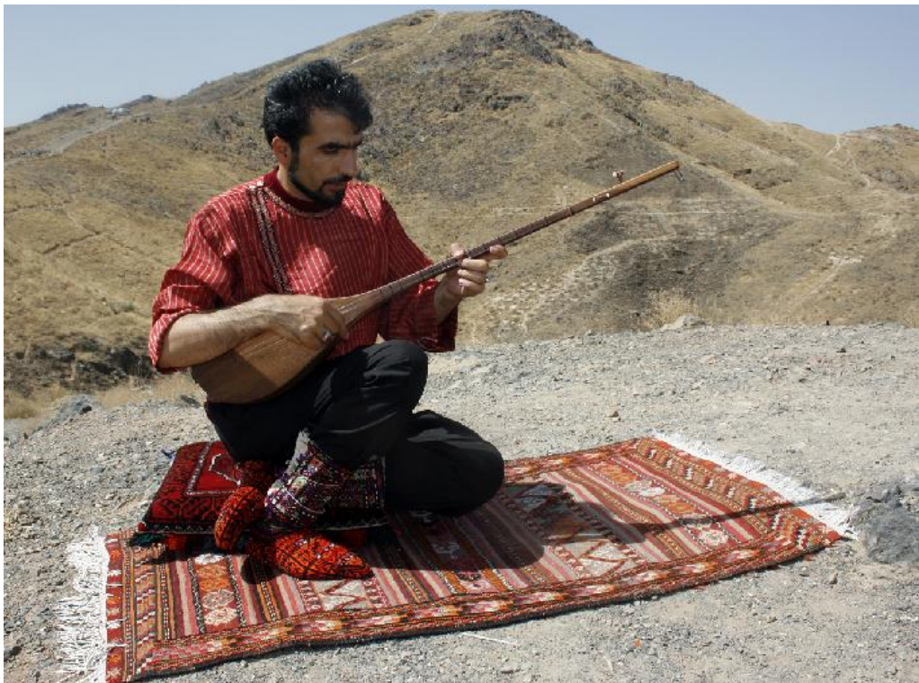
Music of Bakhshis of Korasan