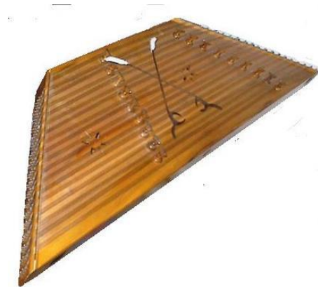
Santur, traditional Iranian dulcimer