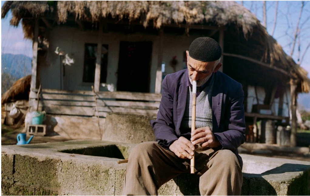
Ney, a traditional Iranian wind instrument (Northern Iran)