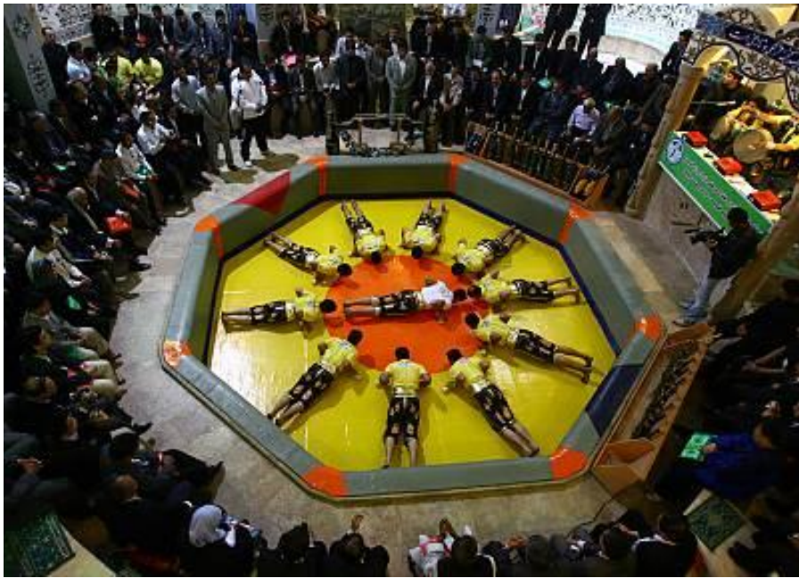
Pahlevani and Zoorkhanei Rituals