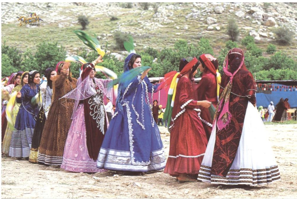
Nomadic Dance of South-west Iran (Fars)