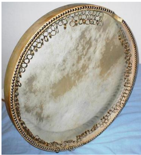
Daf, traditional Iranian percussion