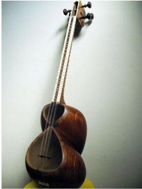
Tar, traditional Iranian string instrument