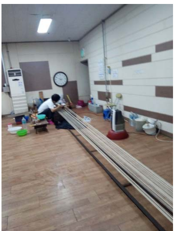
making process of mosi weaving