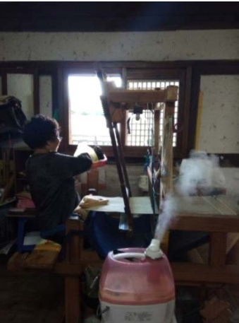
weaving of Hansan mosi