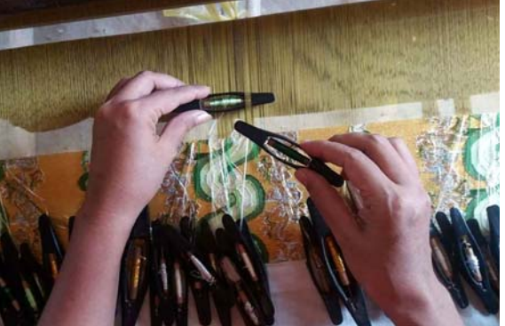
Acheik weaving with Hundred of shuttles