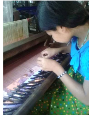
Myanmar Acheik weavers