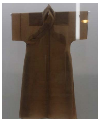
Ancient Hansan mosi clothes in Hansanmosi exhibition Hall