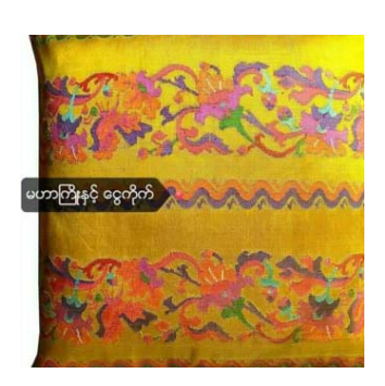
royal filament and silver (mahar kyeo nae ngwe kyit)