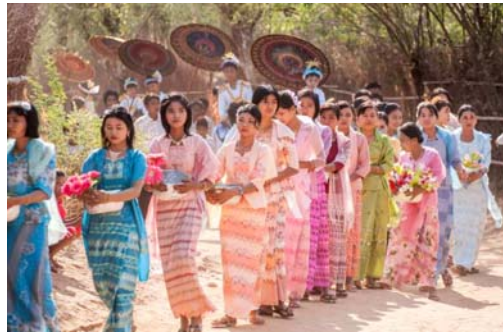
Wearing Acheik design Longyi in Novitiation ceremony