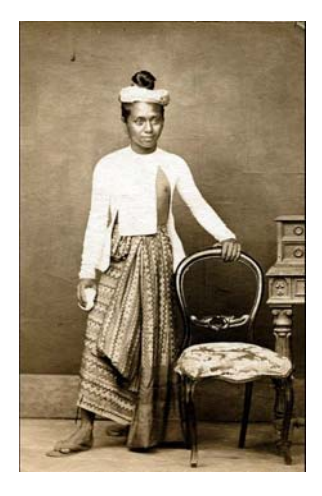
Lady with Achiek Longyi (sarong) Myanmar man with Achiek Pasoe (man sarong)