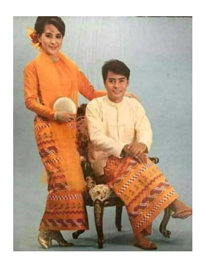
Wearing Myanmar Acheik both man and woman