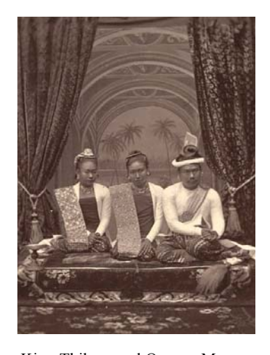
King Thibaw and Queens Myanmar (19th century AD)

From this time, Achiek workshops were situated and mainly produced in Amarapura, Sagaing and Mandalay in upper Myanmar.