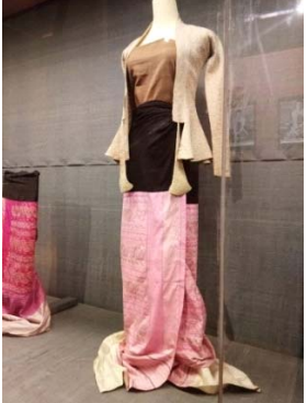
Ancient Acheik Designs which display in Mya Nan San Kyaw Place cultural museum in Mandalay