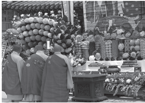
P4. Yeongsanjae includes food offerings with chants @www.thesoulofseoul.net