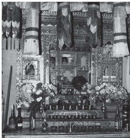
P1. An altar room in Bhutanese homes

Buddhism was introduced to Bhutan as early as the 8th century AD 3) . Guru Rinpoche (the Precious Master) on invitation from an ailing king came to central Bhutan in 746 AD 4) to subdue a tarnished demon that had inflicted a serious ailment on him. He manifested into wrathful forms of mythical animals and furious forms of figures to subdue evil spirits and pacified into the guardians of Buddhism. Gradually the popularity of Buddhism started to flourish throughout the land. It is said that after introduction of the substantive religion, Buddhism played a key role in unification of the people whereby the history of Bhutan was rolled in its literature and manuscripts thereafter. By and by, many renowned Lamas (highly learned priests) mostly from Tibet visited