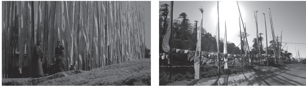
P2. (Left) Monks sitting among the prayer flags. Hoisted along the roadside (right), on mountains and hilltops are common sight.

are doubled and the wrong deed on the contrary, accumulates double-fold sin as well. Therefore, on this day Bhutanese people from all walks of life indulge in religious activities. The way of life of an individual in Bhutan is greatly influenced 6) by religion and plays a huge part in everyday life. From early morning, offering prayers, the usual water offering in seven bowls (choepa), burning incense sticks to purify the surrounding air and lighting butter-lamp, prostrate and worship before the altar in one's own home, groups of people or individuals take a hike to a monastery, which is usually located far from the nearest road, to do the same. This way, they seek blessing from the god and goddess or local deities to seek protection, fulfill their wishes, wish for success in a quest, seek protection for one's family, seek guidance and cure for ill persons and pray to liberate all sentient beings from the world of suffering. Most often food offerings are also made in the temples or monasteries in order to receive blessings from the gods. This way, it is said that one accumulates good deed which will clear the way to heaven after death. The elderly people circumambulate Chortens (religious stupas) and chant prayers.