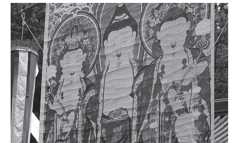
P5. Kwaebul (Tangka)

Yeongsanjae is dubbed as an Important Intangible Cultural Heritage No. 50 in 1973 22) .