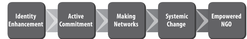
Figure 2 A Social Process of Empowerment

Systemic Change These steps will help NGOs change members' attitude, capacity building by active involvement in documentation, and inventory making, and multi-faceted networks from the bottom (communities, groups and individuals of ICH) to the top organizations (the central and local governments and UNESCO).