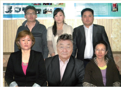
Project Team in Mongolia

The FPNCH, with financial support and cooperation of ICHCAP, has implemented the Joint Cooperation Project of Safeguarding Intangible Cultural Heritage by Utilising Information Technology, which aimed to restore and digitise superannuated magnetic tapes being kept at the ILL, Academy of Sciences. The project was implemented between October 2011 and April 2012. As a result, 715 hours of magnetic tape recordings were successfully restored and digitised. Besides categorising and establishing a database with the digitised recordings, ten-CD box sets were produced using selected data recordings from the database and distributed to the general public. The creation and distribution of the audio CDs is valuable for researchers and scholars who use the recordings for research and study.