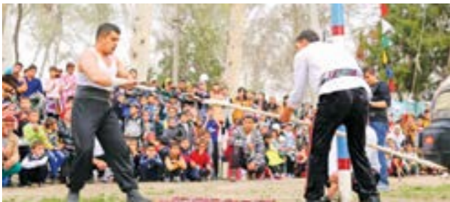
Director: Iqboljon MELIKUZIEV UZBEKISTAN | 2017 | 22MIN | HD | COLOR, B/W