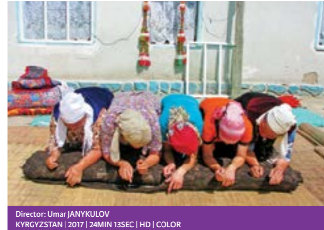
Director: Umar JANYKULOV KYRGYZSTAN | 2017 | 24MIN 13SEC | HD | COLOR

Kymyz preparation was kept secret by nomads for centuries. The mare's milk is stored in animal skins called chanach that were firstly cleaned and smoked over a fire with pine or other coniferous branches to give the drink its unique smell and taste.