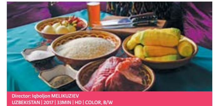
Director: Iqboljon MELIKUZIEV UZBEKISTAN | 2017 | 33MIN | HD | COLOR, B/W

Performances of folk teams, puppet masters, rope walkers, polvons (wrestlers), and modern music singers and different folk game competitions organized during Navruz. Navruz is not only the beginning of the New Year, but it is the power that brings people closer and spreads love and affection among people.