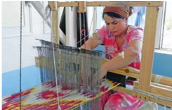
Director: Dilovar SULTONOV TAJIKISTAN | 2017 | 40MIN | HD | COLOR

Embroidery a favorite hobby of Tajik women, being practiced in various forms and styles in different parts of Tajikistan. Suzaniduzi is a popular form of embroidered needlework. Initially, a naqsh (drawing) is outlined on cloth and later is embroidered with colorful thread, according to the taste of the embroiderer. Every suzaniduzi pattern has a specific meaning. Most naqsh are inspired by nature. The patterns have ceremonial significance, and that's why most of them are prepared for brides and the house of newlywed couples.