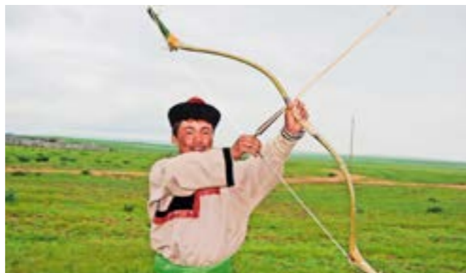
Director: Jumdaan CHOIMBOL MONGOLIA | 2017 | 35MIN 15SEC | HD | COLOR

The occasion of fermenting a mare's milk is celebrated with a feast that is held within three days of tethering foals. The ceremony is held to summon prosperity, to encourage horse herds to multiply, to wish for an abundance of airag (fermented mare's milk) and other dairy products, and to bless newborn animals. During the ceremony, the proceedings (tethering foals, milking mares, holding a milk libation ritual, reciting milk libation and anointment, and sharing the ceremonial mutton and mare milking feast) are carried out alternately.