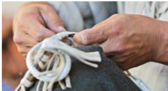
Director: Aleksey KAMENSKIY KAZAKHSTAN | 2017 | 23MIN | HD | COLOR

Felt making is one of the oldest traditions, bearing an artistic and aesthetic value and symbolism closely associated with folk customs and rituals. The process of collecting wool is twice a year—in autumn and in spring. A story about the historical value and ubiquitous use of rams' skins. The process and the staged technique of felting. One way to preserve traditional felt making. It is a question of the ecological value of felt, the methods of extraction from natural materials (plants and stones), and the use of certain ornaments associated with nature and animals.