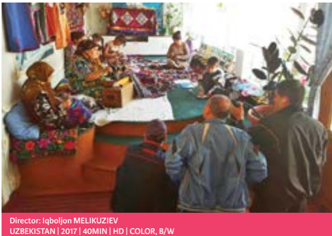
Director: Iqboljon MELIKUZIEV UZBEKISTAN | 2017 | 40MIN | HD | COLOR, B/W