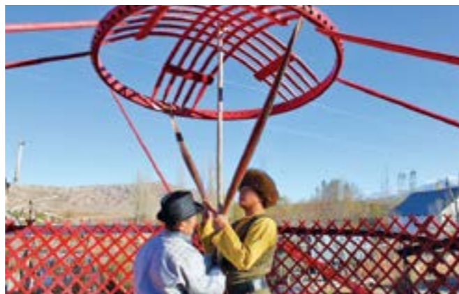
Director: Umar JANYKULOV KYRGYZSTAN | 2017 | 15MIN 36SEC | HD | COLOR

This film is about rituals related to children. Included are kyrkyn chygaruu , a ritual celebrating the fortieth day after a child's birth; beshike saluu , a ritual of placing baby in the cradle; tushoo kesuu , a ritual of cutting rope tied around a baby's ankles; and bata , a blessing ritual. Knowledge holders talk about the significance of each ritual in a child's life cycle. The film shows how these rituals are conducted now and how they have evolved over time.