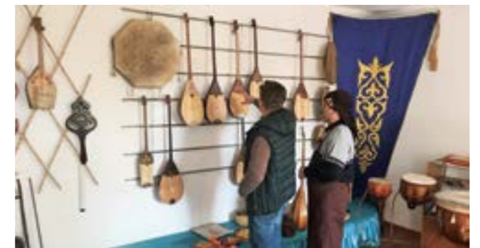
Director: Aleksey KAMENSKIY KAZAKHSTAN | 2017 | 22MIN | HD | COLOR

Orteke (mountain goat) is the name of an indigenous Kazakh performing art in which flexible wooden figure of a mountain goat is placed on a traditional drum called dauylpaz . Orteke's originality comes from it being a combination of theater, music, and puppet dance. The expressive puppet figure, called teke (goat), seems to come to life when the master starts playing the drum. The figure makes funny dance movements in time with the rhythm of the music being played. It is also said that the orteke figure once came different shapes and sizes that were created individually, each with a different number of moving limbs, depending on which kyu was performed.