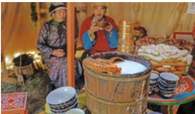
Director: Mendbayar TUGULDUR MONGOLIA | 2017 | 45MIN 15SEC | HD | COLOR

Mongolian worship ceremonies are performed at sacred sites to invoke assistance from deities of nature: in the summer for timely rain and abundant pastures and in the autumn for protecting humans and livestock from a harsh winter. The tradition maintains a variety of forms of intangible cultural heritage and builds a sense of community and solidarity among the people while strengthening awareness of the importance of protecting the environment. On a specified day, all the participants gather early in the morning at the worship site. Everyone wears their ceremonial clothes and brings offerings to the deities.