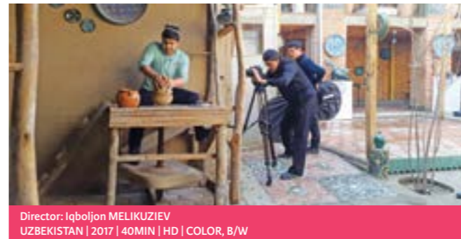
Director: Iqboljon MELIKUZIEV UZBEKISTAN | 2017 | 40MIN | HD | COLOR, B/W