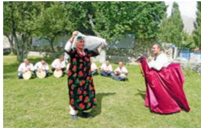
Director: Dilovar SULTONOV TAJIKISTAN | 2017 | 40MIN | HD | COLOR

The artful Tajiks of Central Asia invented and preserved their crafts and traditions since ancient times. One popular craft among the people is textile weaving, mainly silk weaving, which has its own local features throughout Tajikistan. Atlas and adras silk fabrics as well as chitgari (block-printing) made with natural colors are known in northern Tajikistan while gulbast is known in southern regions.