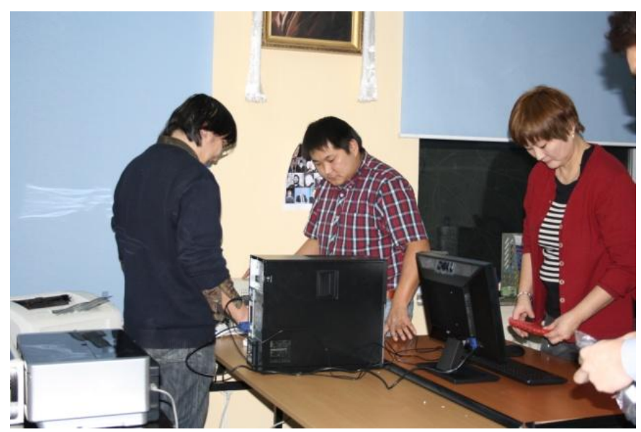
Setting up the equipment and providing with guidelines 2