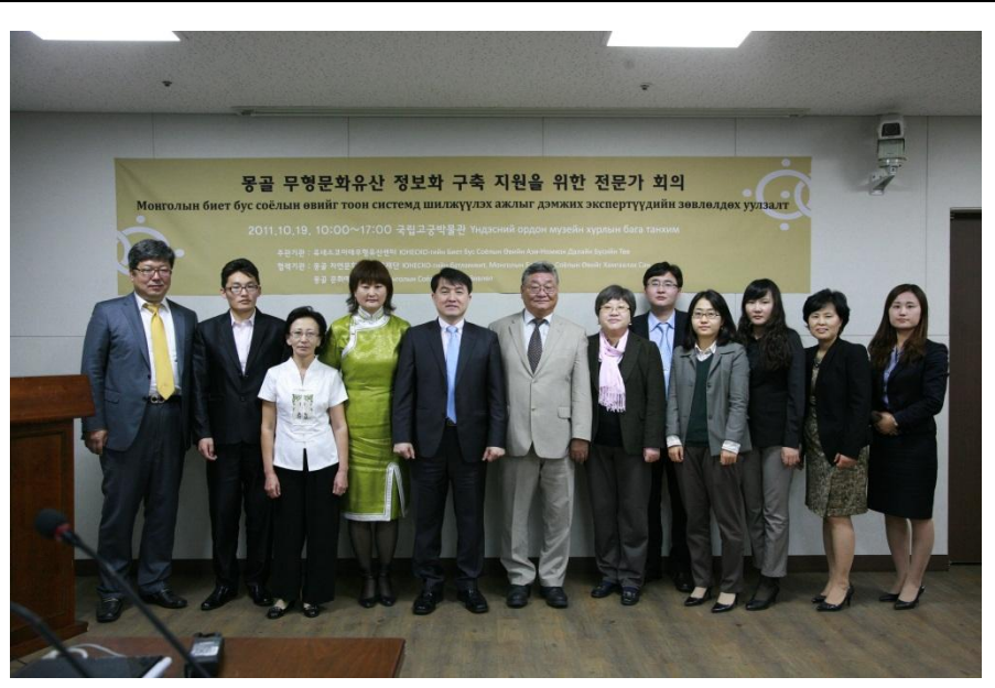
Mongolian delegates to the Expert Meeting