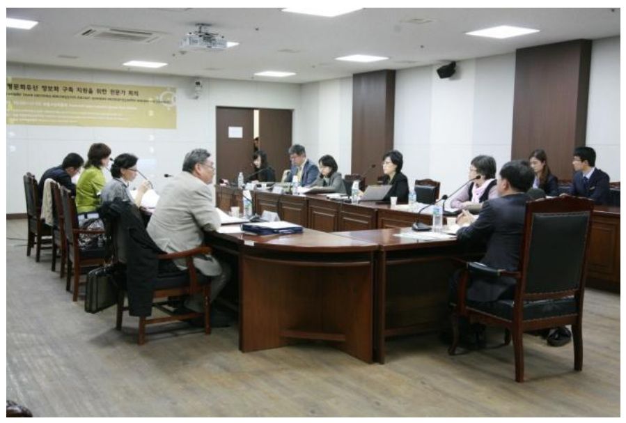
Mongolia-ICHCAP Expert meeting in Korea