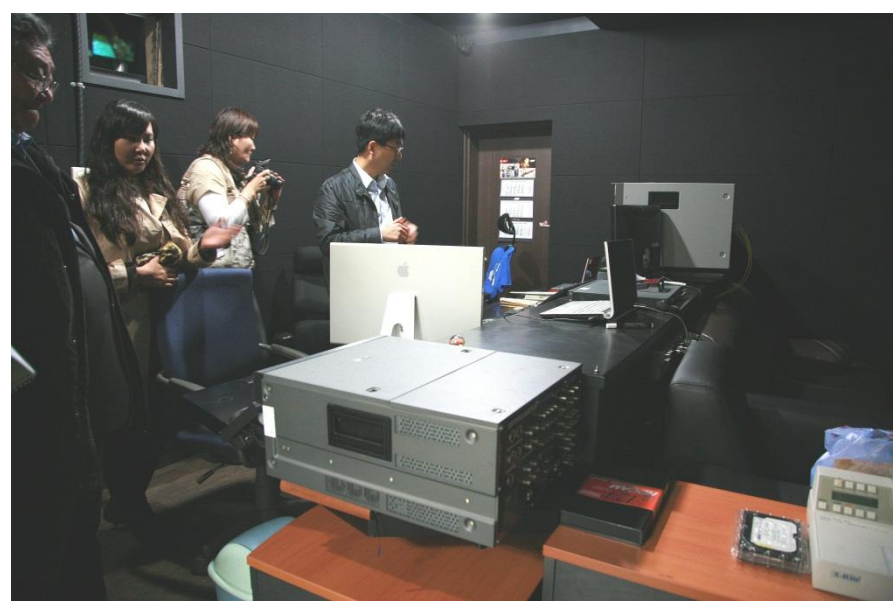
Visiting at Korean Film Council 1