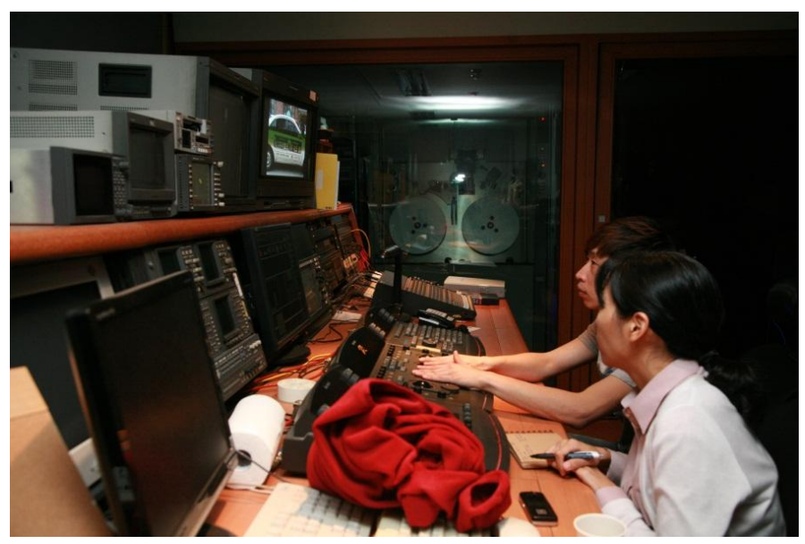
Visiting at Korean Film Council 2