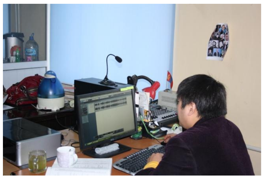
Process of restoration and digitisation 2