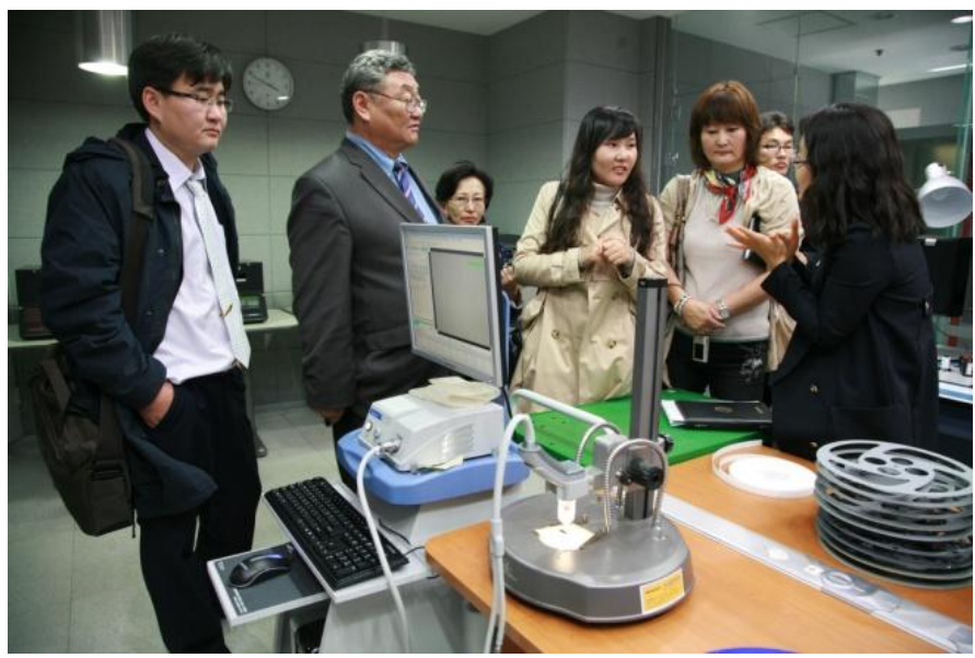
Visiting at National Archives of Korea