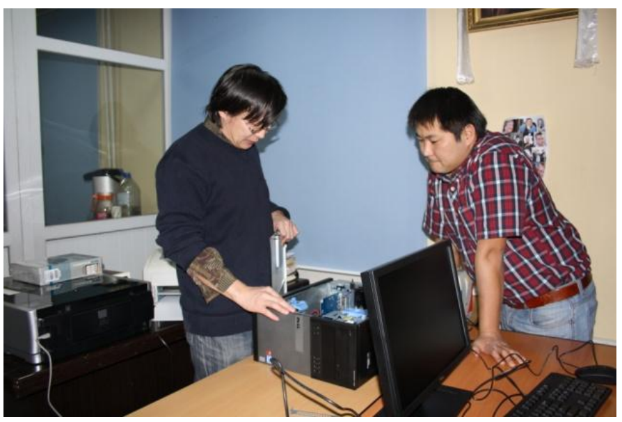
Setting up the equipment and providing with guidelines 1