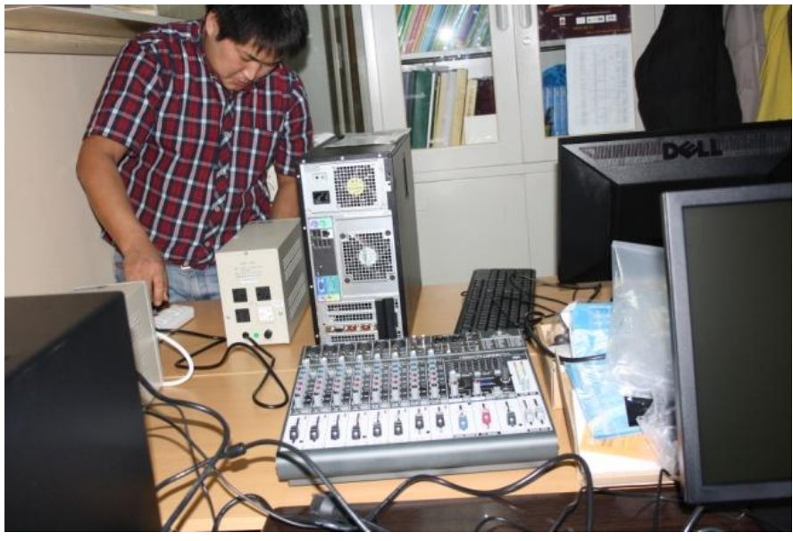
Process of restoration and digitisation 1