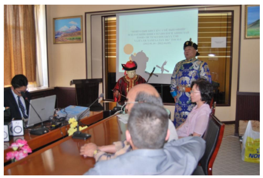
Initiation of the Ceremony with an "Ertnii Saikhan" Folk Long Song