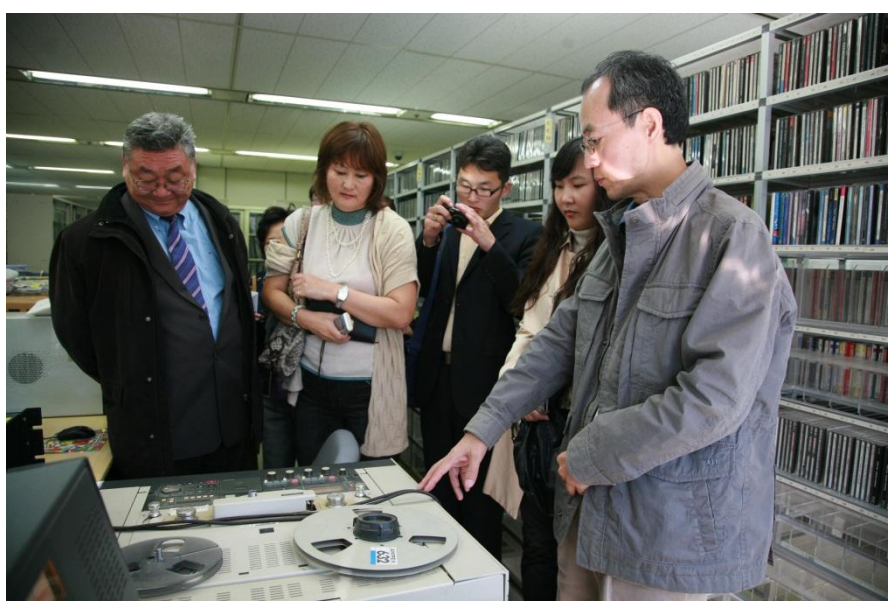
Listening Experiences for Recording and Digitising ICH-related Sound Data at MBC