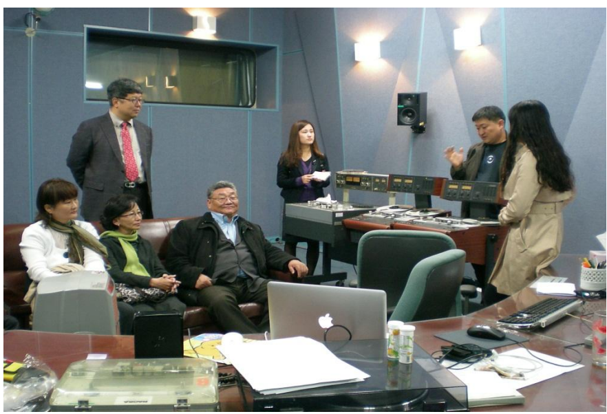
Visiting at Namyangju Studio of Korean Film Council