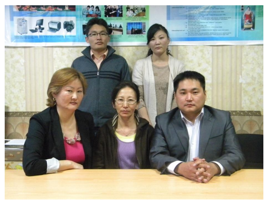
Restoration and digitisation team