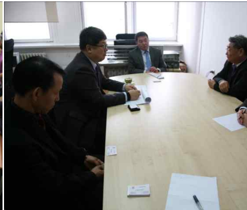
Meeting with the Mongolian National Commission of UNESCO 1