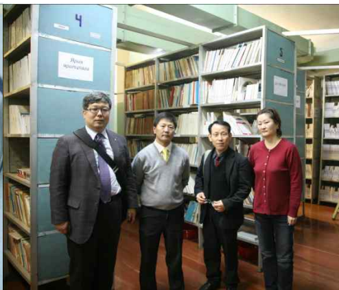
Reel Tape Storing room at Mongolian National Public Radio