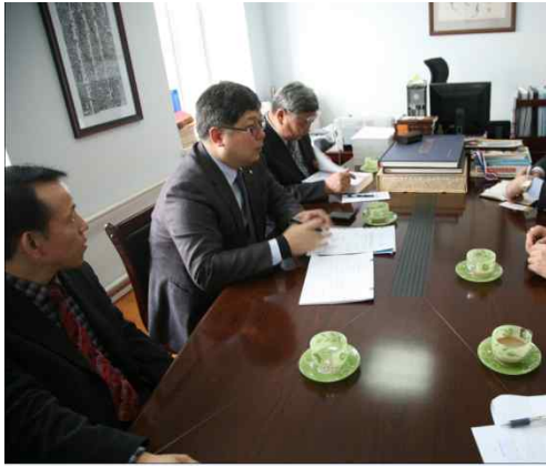
Meeting with the Language and Literature Institute