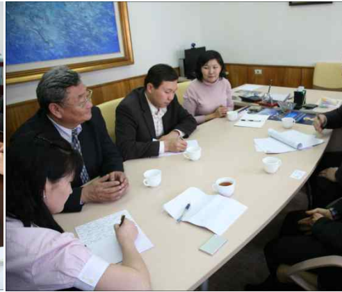
Meeting with the Mongolian Government Culture and Arts Committee