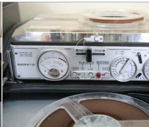
Equipment of Language and Literature Institute 1