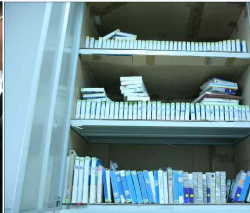
Data of Language and Literature Institute 3