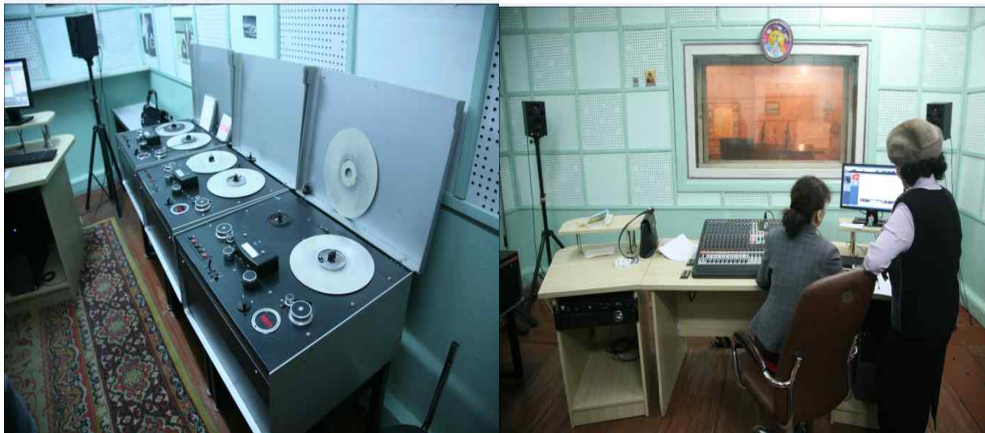
Reel Tape Player at Mongolian National Public Radio