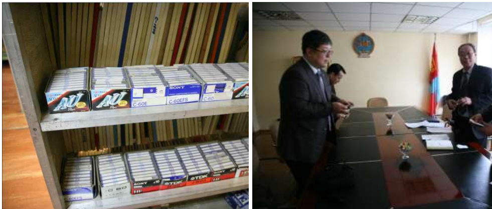
Compact Cassette at Mongolian National Public Radio