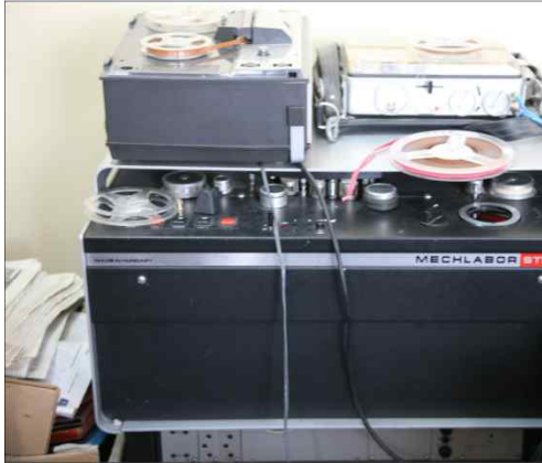
Equipment of Language and Literature Institute 2