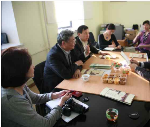
Meeting with the Foundation for Protection of Natural and Cultural Heritage