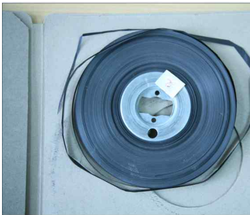
Data of Language and Literature Institute 4