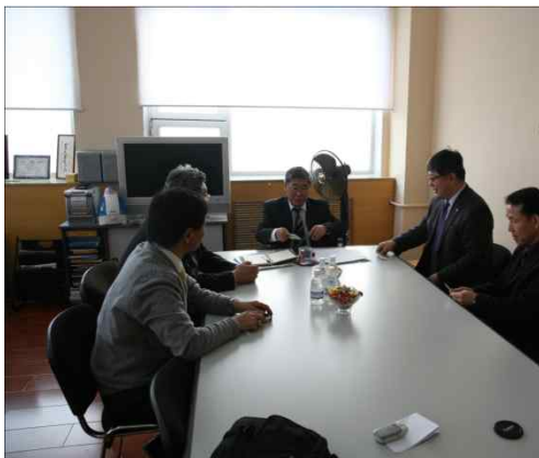
Meeting with the Mongolian National Commission of UNESCO 2