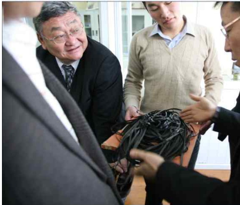
Data of Language and Literature Institute 2