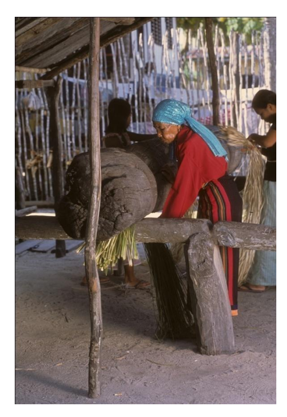
Tepo (Mat) Weaving of the Sama