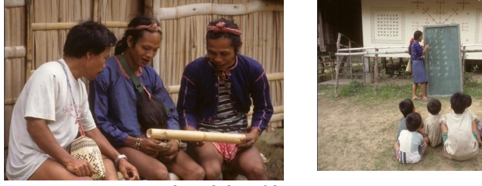
The Ambahan of the Hanunuo Mangyam