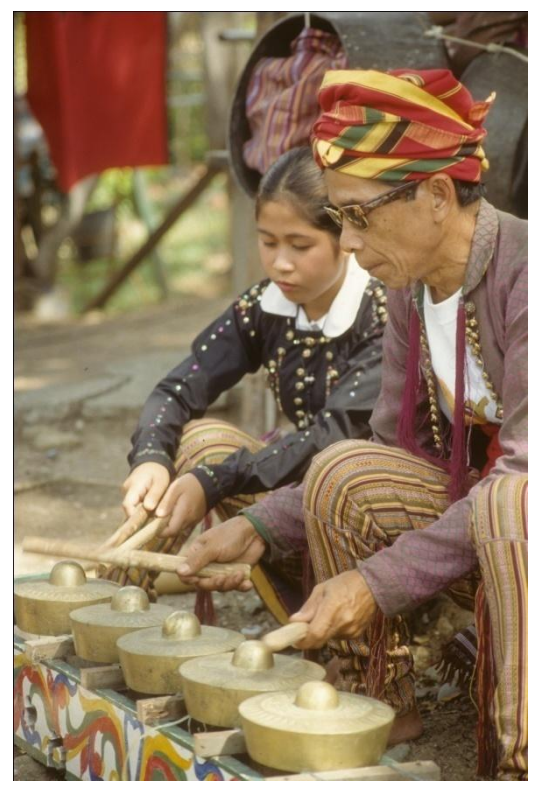
Playing the Kwintangan (five bossed gong)