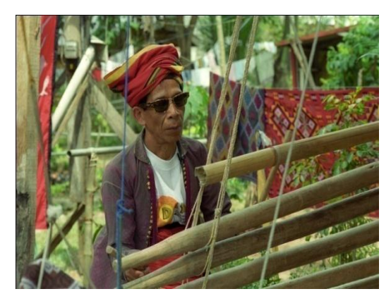
Traditional Yakan Music