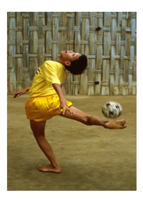
Male solo playing style of Myanmar Chinlone 🔺

▲ Female solo playing style of Myanmar Chinlone