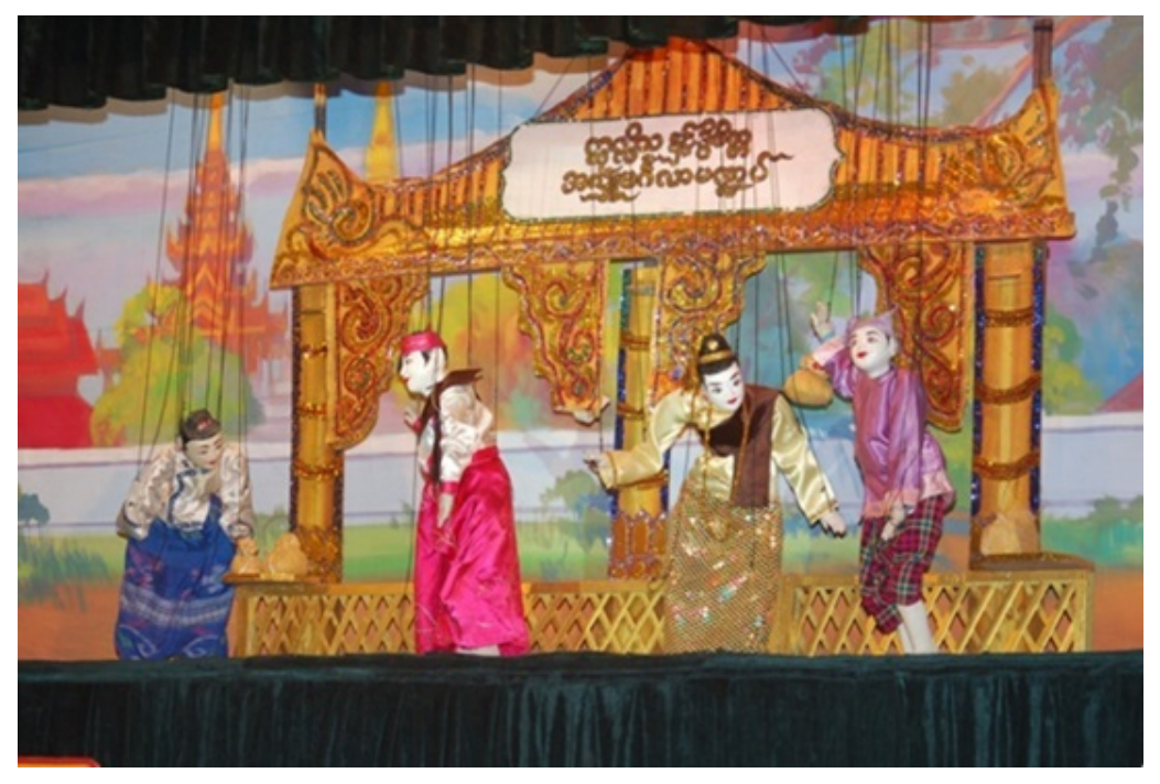
▲ Myanmar Marionette (Grand Drama) Contest