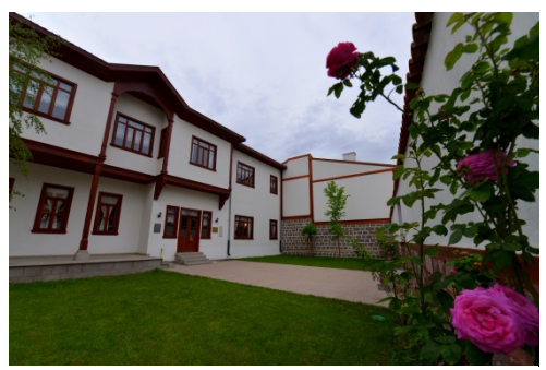
<Figure 4> "Intangible Cultural Heritage Museum of Ankara"

Purpose: By revitalizing the traditions in the 43 museum area the transmission process of ICH will be activated. ICH Convention gives priority to museums and museum education. Thus in this regard activities concerning the ICH will be performed in the