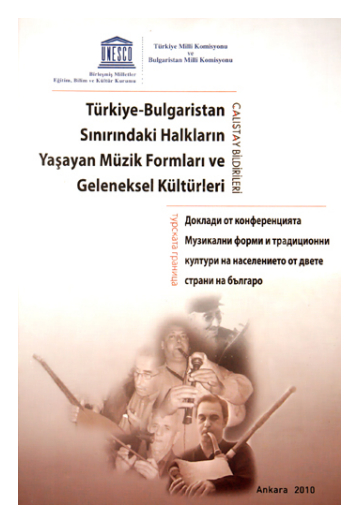
<Figure 1> Book of Musical Forms and Traditional Cultures of the Peoples of the Border Regions of Turkey and Bulgaria

Purpose: As a part of this project, which has been designed to bring Turkish and Bulgarian music and culture experts together to conduct field studies on the musical culture found on both sides of the border, along with that of the preserved National Park area. With the idea to examine the existing cultural heritage present in both countries. The first field studies were conducted in Bulgaria between the dates October, 9 and 15, 2009. In this research and compilation work conducted in the border regions of Bulgaria, adjacent to