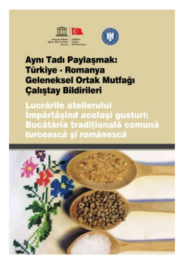
<Figure 3> Book of Turkish and Romanian Common Traditional Cuisine Project

Purpose: Turkey and Romania are two countries which have shared experiences for hundreds of years by means of migration, cultural exchange and interaction and thus, formed a common heritage. This project, which seeks to find the aspects of mutual interaction in food culture of the two countries. shall not only instrument in strengthening the existing friendship and cooperation, but also shall take a leading role in investigating, defining, sharing and protecting cultural heritage known not by