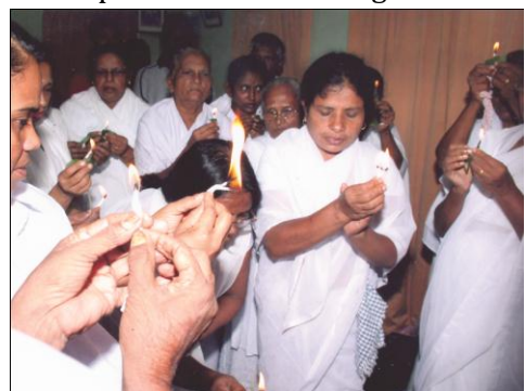
Kiriammas (Grandmothers)bless the residents with the lamp wicks in hand at the end of the ritual early in the morning