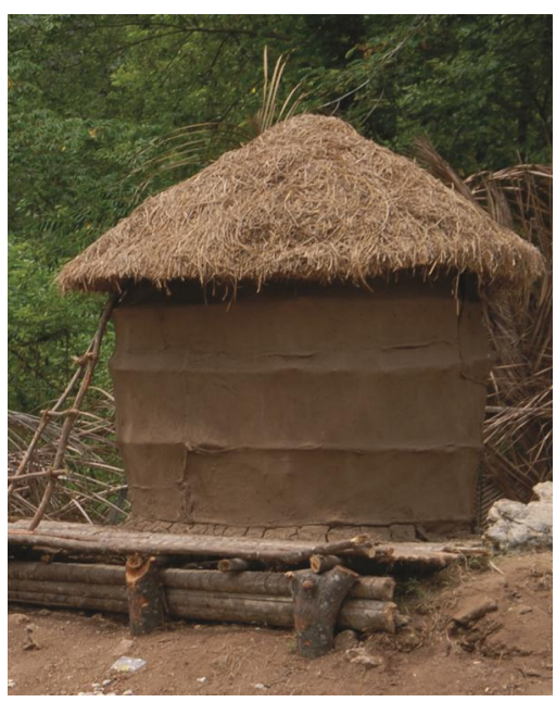
Traditional paddy store called Bissa