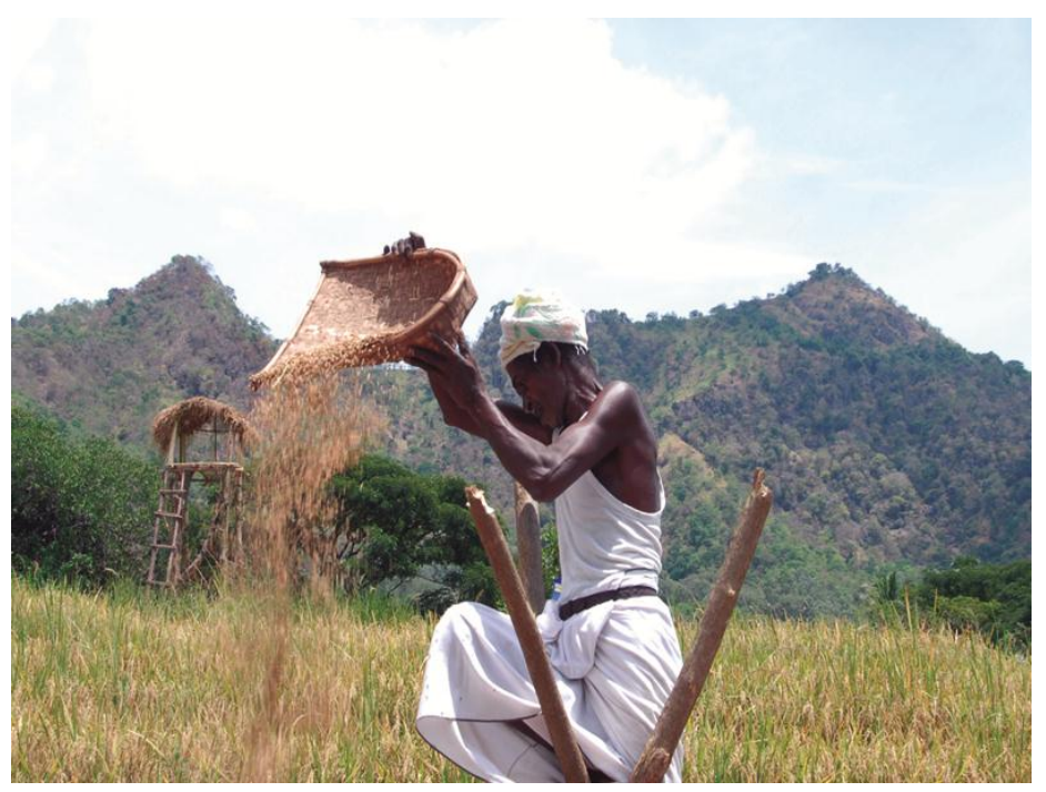
Winnowing of paddy after threshing in the threshing floor of the field by going up the cross structure made for the occasion