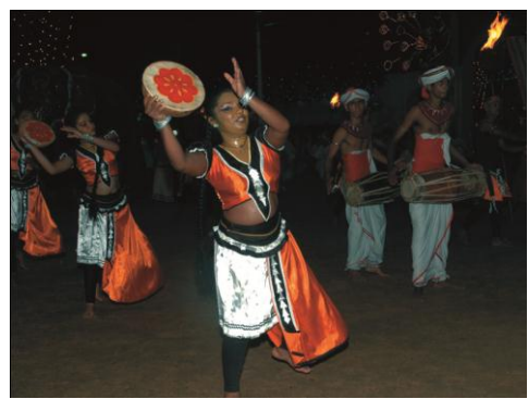
Traditional hand drum (Ath rabana) player participating in the procession