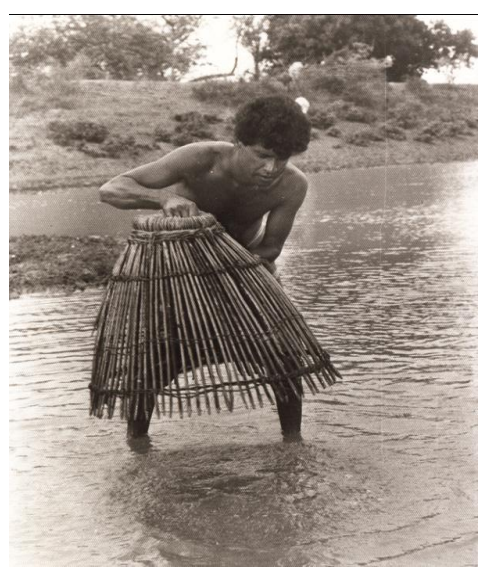
Fishing through a traditional fishing basket