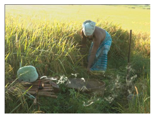
Performing rituals in the field before reaping