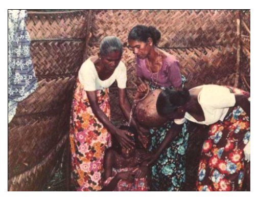
First bathing after puberty