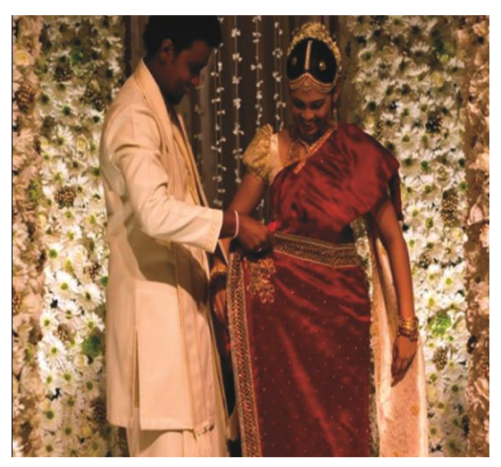
Groom dresses the bridegroom with clothes and jewelry during the Poruwa ceremony of a wedding