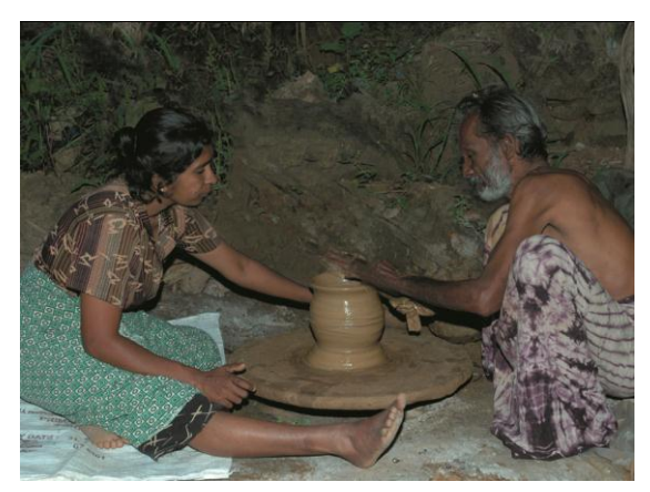
Traditional potters at work on potter's wheel (Saka poruwa)