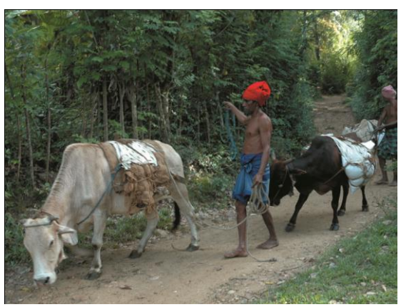
Traditional mode of transporting goods on the back of bulls(Thavalam)