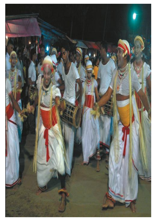
Low country dancers on parade