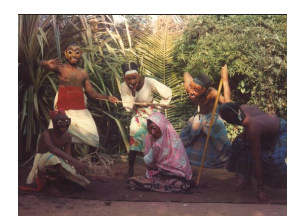
Performance of a kolam dance a traditional folk art