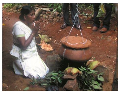
Ritual associated with the preparation of indigenous medicinal decoction. (Agra Raja Kasaya)