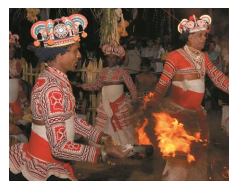
Low country dancers performing a ritual with burning of resin