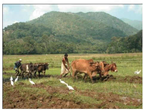
Cultivators singing while ploughing with oxen (Andahera pema)