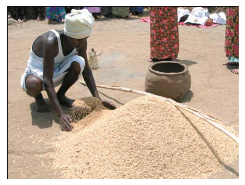
Threshed paddy is ready to be taken home and hence measured