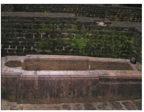
An ancient stone boat used by the indigenous practitioners to immerse the patients in oil baths