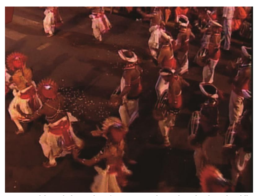
Dancers of the Dalada Perehara( Possession of sacred tooth relics of Buddha