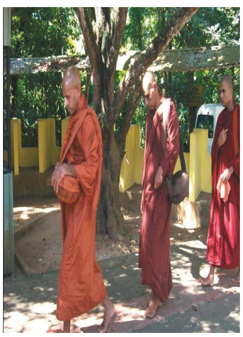
Conducting the Bikkhus for an alms giving