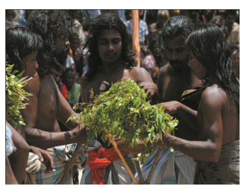
Dance round the milk bowl