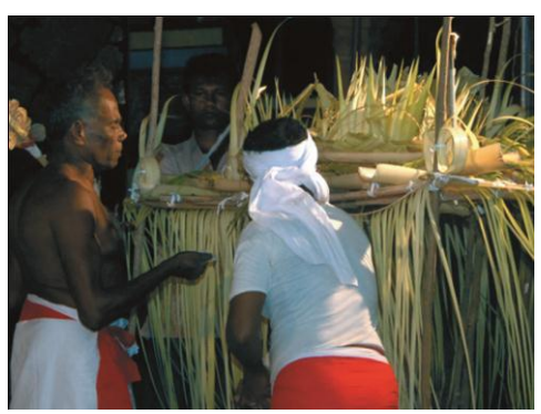
Mal yahana or the ritual structure built for offering at traditional rituals