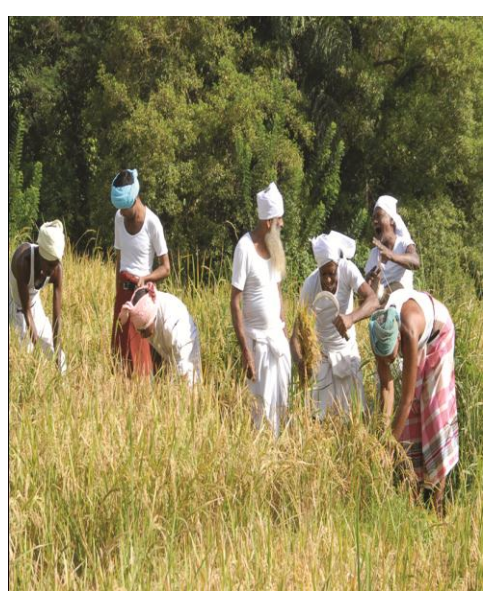
Reaping paddy in the field