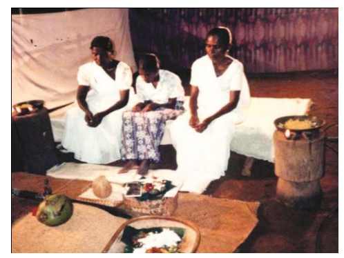
The two wooden mortars with lighted oil lamps either side of the girl.