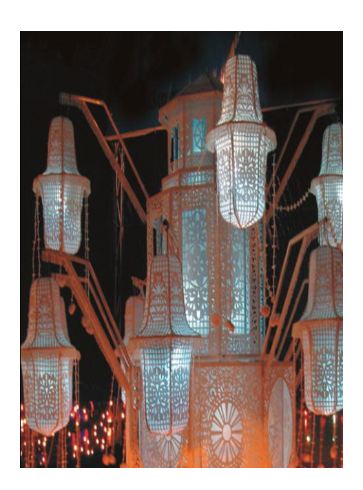
Wesak lantern made on Wesak poya day to mark the birth, enlightenment, and passing away of Buddha.