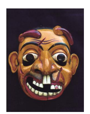
A Mask of a Sanni Yaka(Amukku Sanniya) insigenous name For a sickness