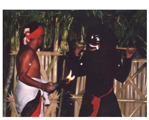
Ritual Ceremony of Devil dancing