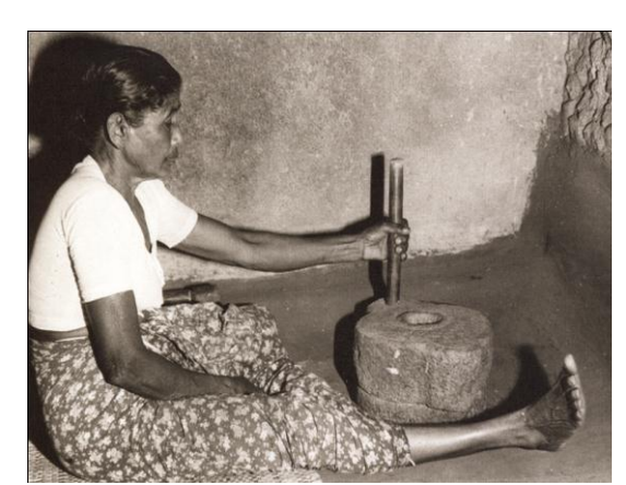
Cuisine – Grinding flour to Prepare the traditional sweets by a grinding stone (Kurakan gala)