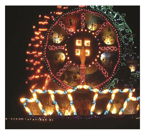
Decorated illuminated pandol constructed for Wesak poya Celebrations to mark birth, enlightenment, and passing away of Buddha