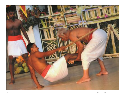
Angampora is an ancient marshal art practiced by a set of special families in Sri Lanka