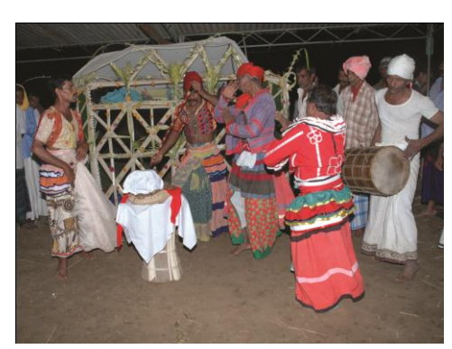
Ritual associated with healing of cattle on a floral structure (Mal asna)