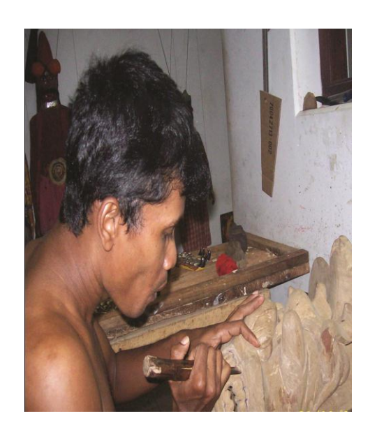
Traditional masks carver at work