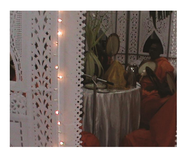
Buddhist Pirith chanting ceremony to invoke blessing