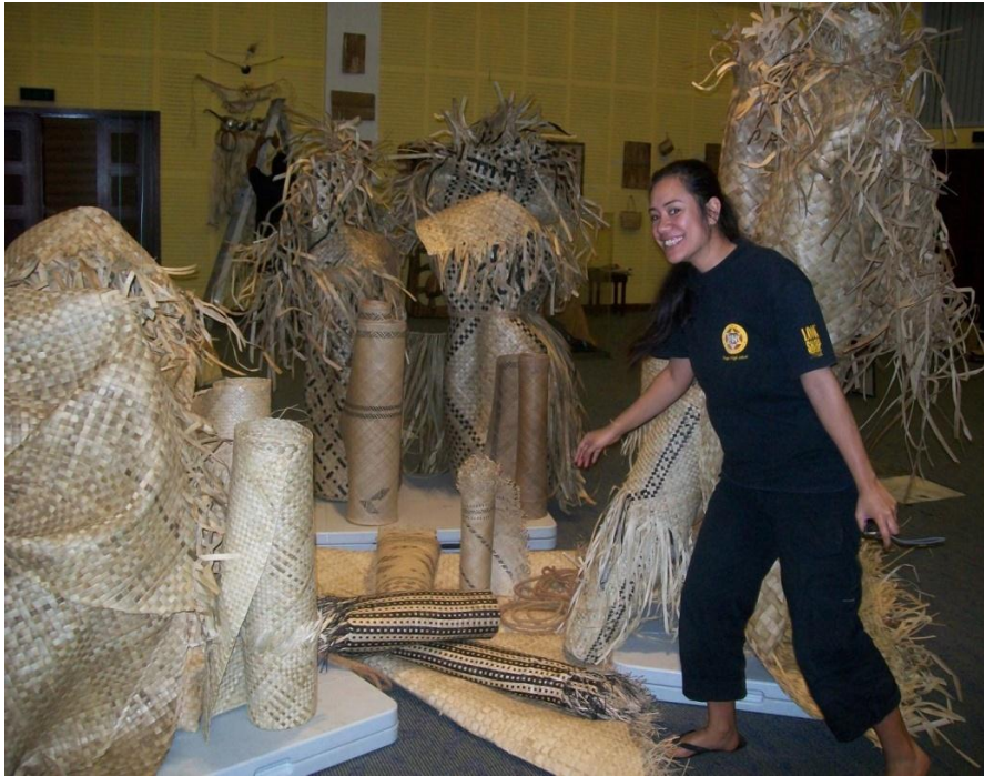
Different type of attires for funeral from royal family, displayed at Fa'onelua Convention Centre during Kava Kuo Heka in August, 2010.

The smaller and bigger of the attire to be worn depend on your relationship to the person who passed away. If he/she from your father's side then you wore bigger attire, if from your mother's side then you wore smaller attire.