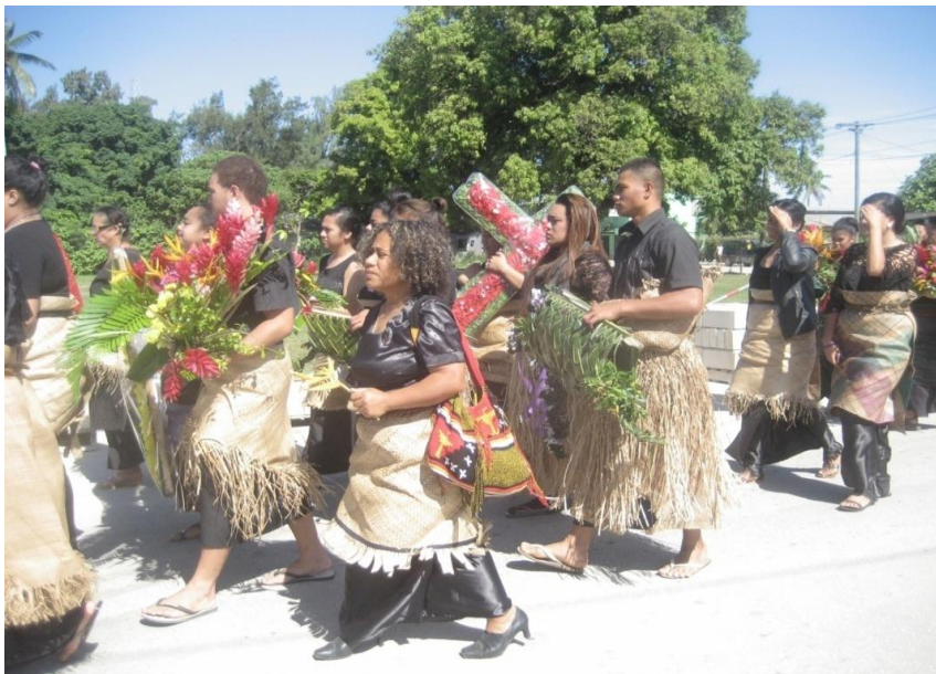
Traditional attire in time of funeral.