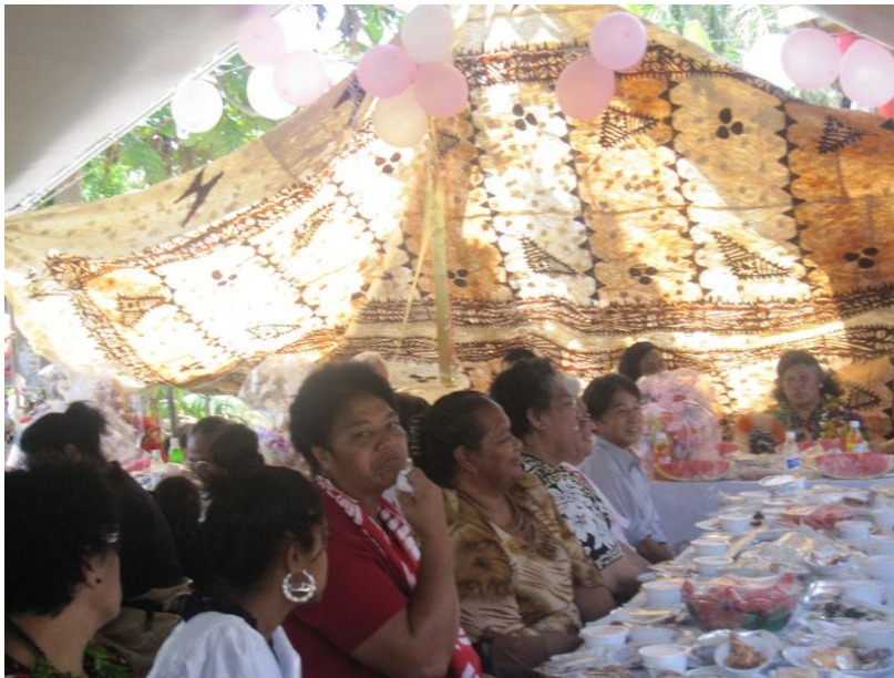
Luncheon after wedding ceremony at church.