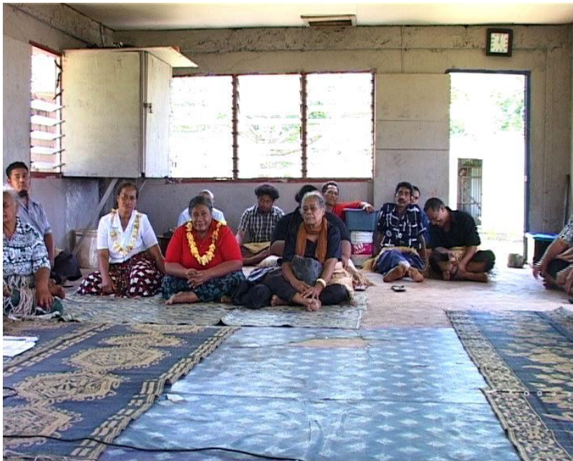
'Esia ,Niuafu'ou in October, 2010