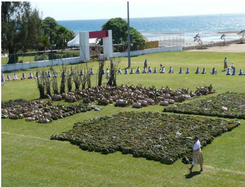
Traditional Kava presentation to mark the inauguration of His Majesty, King George Tupou V in August, 2008.