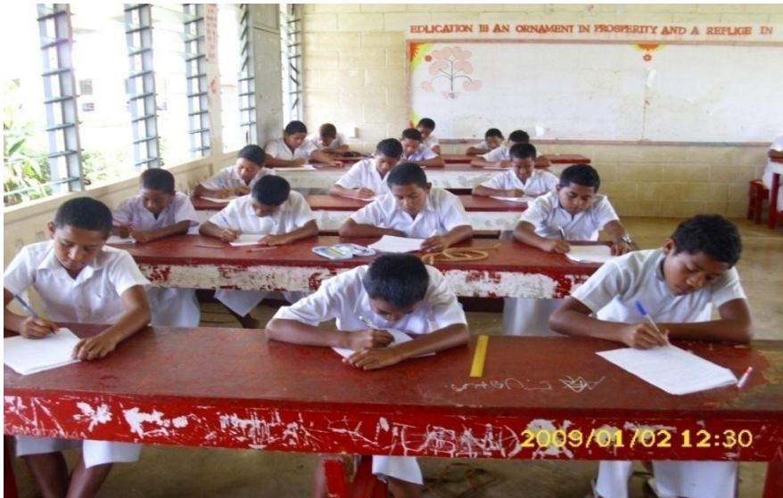
G3: Kava Kuo Heka Exhibitions, Images during Coronation in August 2008