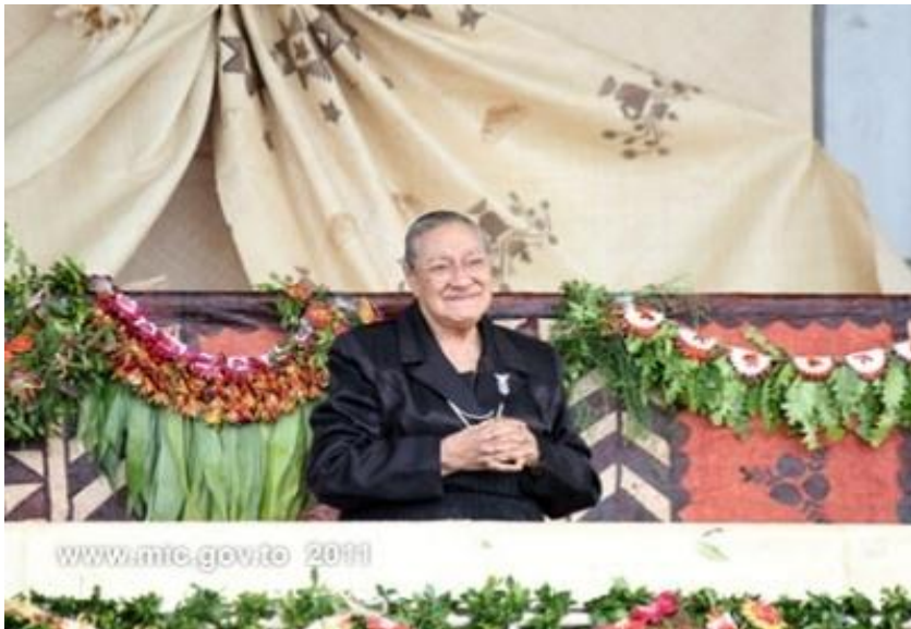
Her Majesty, Queen Mother during Education Day, 27 May, 2011 in celebrating her 85 th birthday.