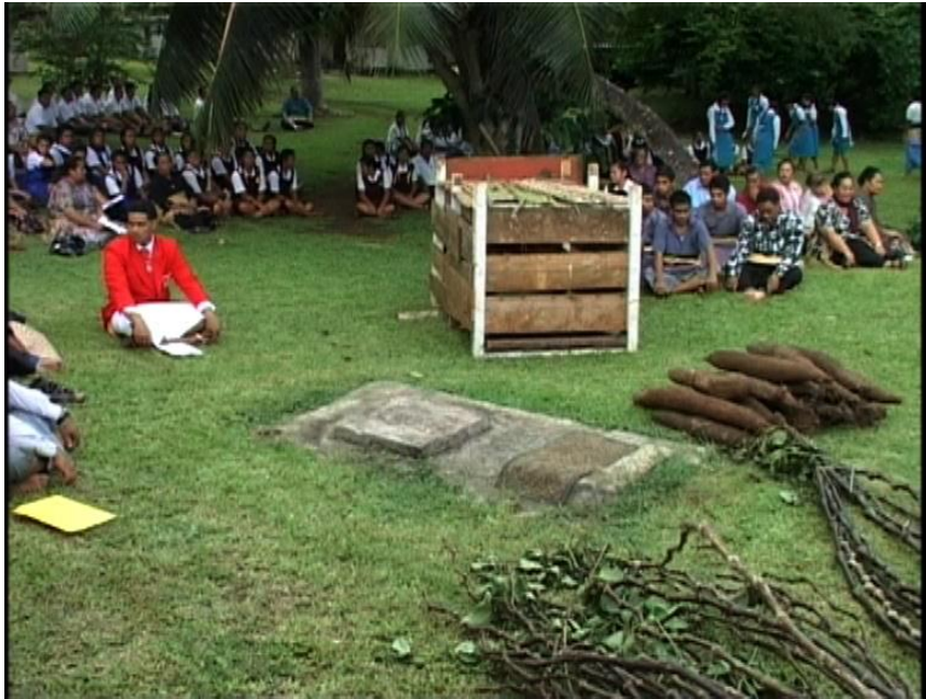
G3: Traditional presentation to Her Majesty, Queen Halaevalu Mata'aho by the students of all secondary school student in Tongatapu, May 2011