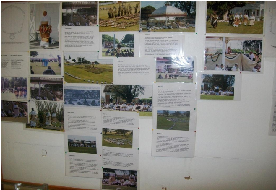
Rituals during taumafa kava (Kava circle) confirmation of His Majesty's crowning to be the King.