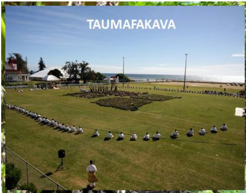
Traditional Kava ceremony confirmed that King George V rightful King of Tonga.