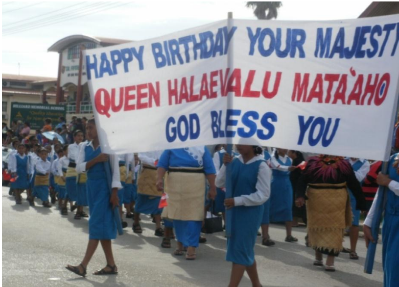
Students marching to celebrate Her Majesty's 85 th birthday in May 2011.