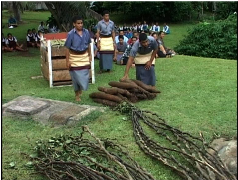
G3: Traditional presentation of yam,kava,puaka toho to Her Majesty Queen Halaevalu Mata'aho, May 2011.

Classic example of how students social practices and rituals at secondary school level.