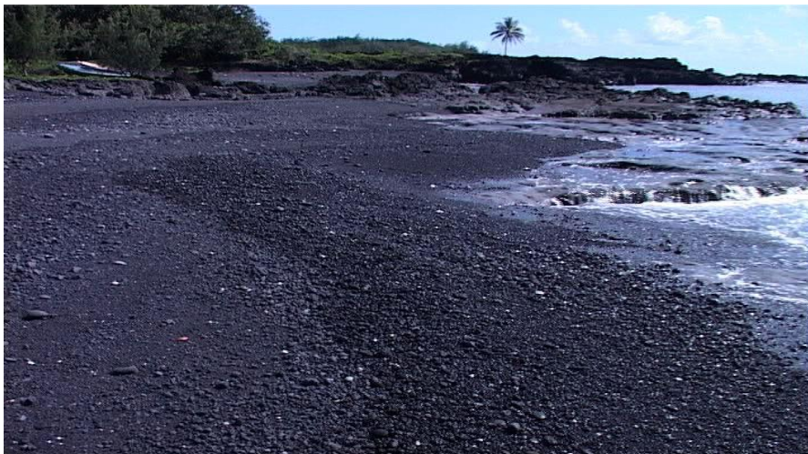
Kilikili is only found at Niufo'ou, October, 2010.

Kilikili (special stone to put on top of graveward after burial)