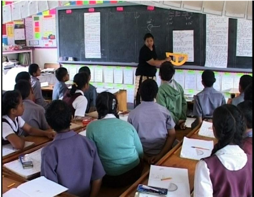
Teacher at Tonga Side School taught the students on the new curriculum with the new teaching resource materials.