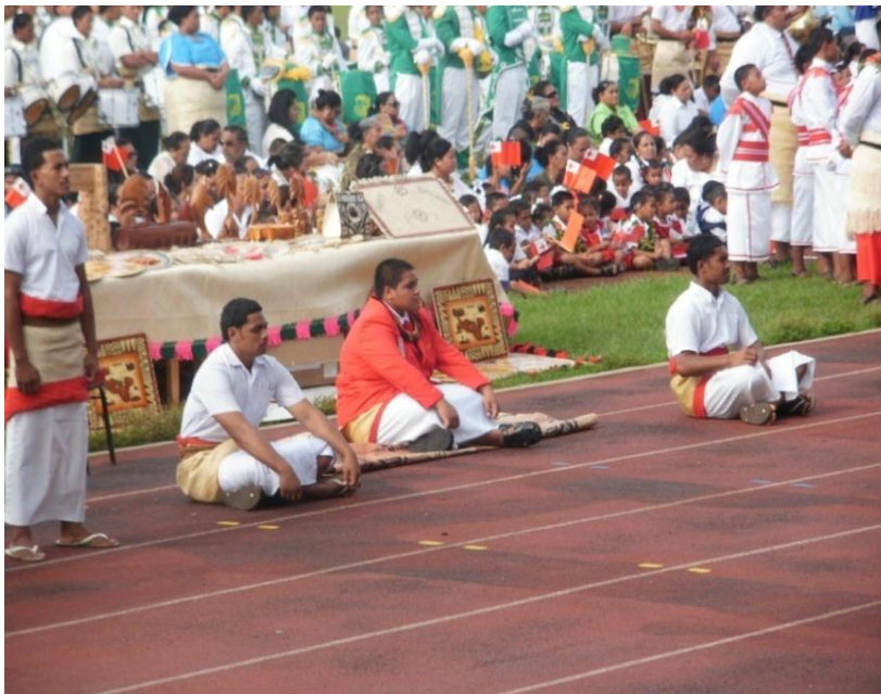
Students presentation of gifts to Her Majesty Queen Halaevalu Mata'aho to honour her 85 th birthday in May, 2011.