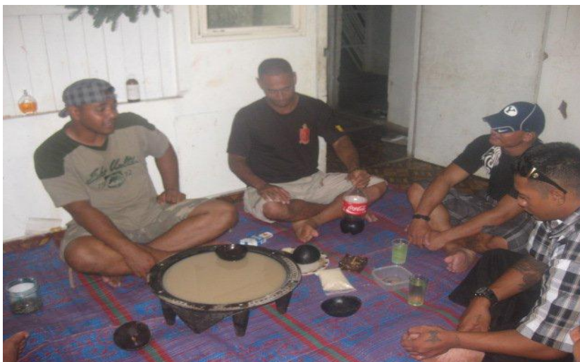
Youth with their kumete kava (bowl of kava) on Friday evening.