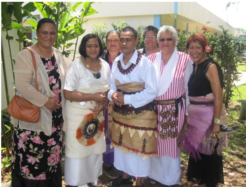
Bride and the groom with friends.