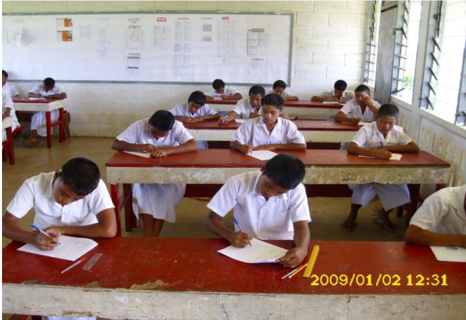
G1 Students of Tonga College representing Secondary school in sitting one of the national exams.

Photos are shown below to demonstrate how transmission of knowledge and skills being transmitted from one generation to another. G1, G2, G3, G4, G5, G6, G9, G10 & G12.