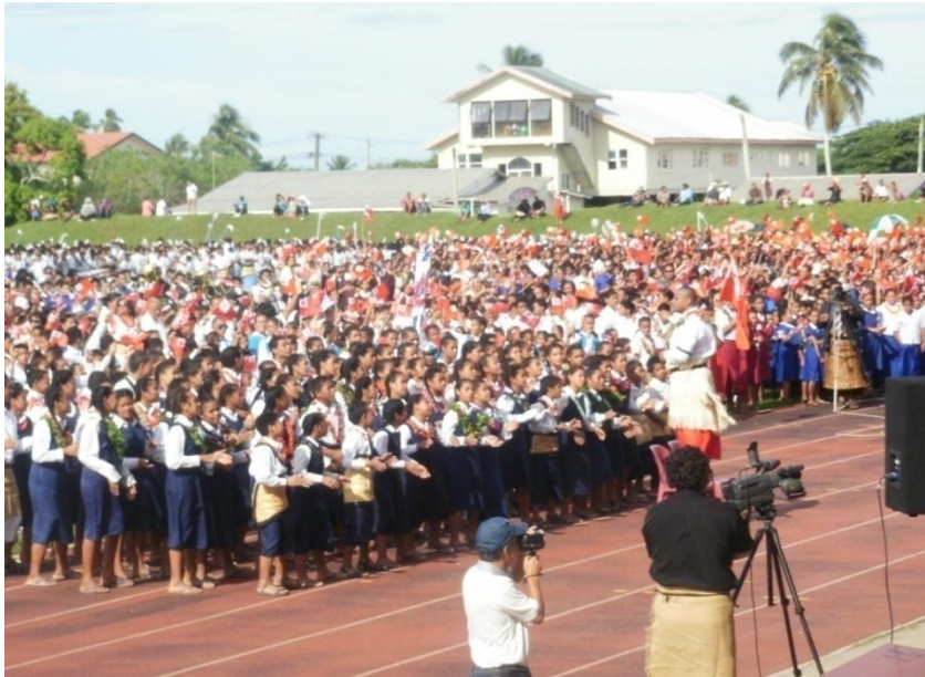
All level of education including early childhood,primary school,secondary school and tertiary level gathered together at Teufaiva Playground to celebrate Her Majesty's 85 th birthday in May 2011.