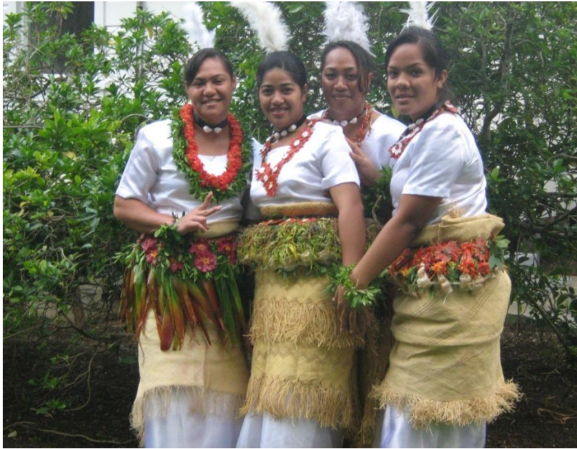
G6: Schools, Government Organisation and Non Government Organisation & School Anniversaries

(This photo was taken during celebration of a school anniversaries)