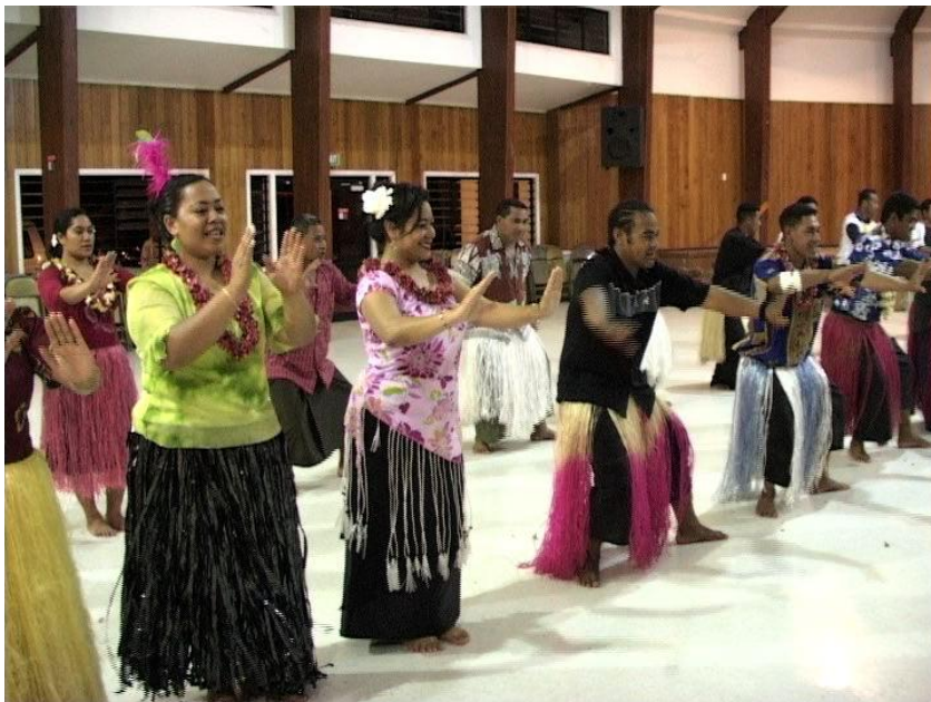
G5: Churches and Youth Programmes

Youth of Kolovai Community in practicing lakalaka at the community hall.