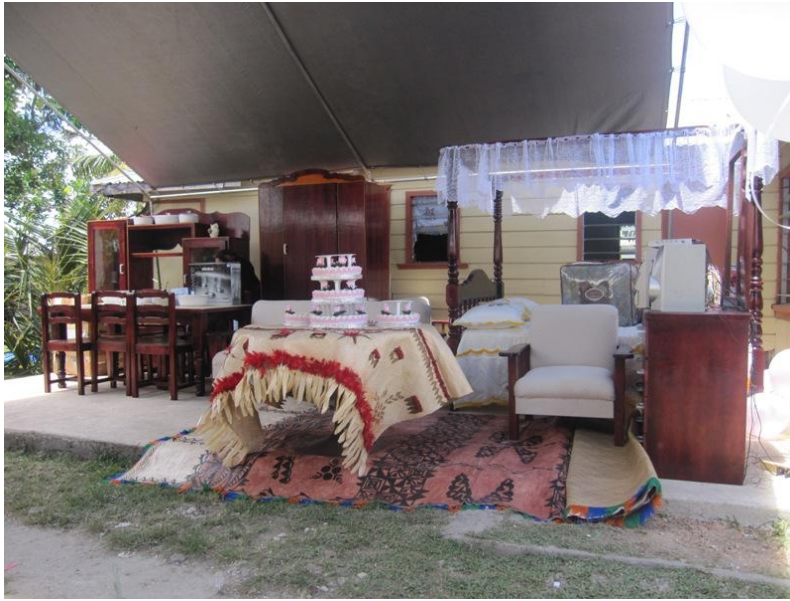
Presentation of bride stuff to be taken to the newly wed home.