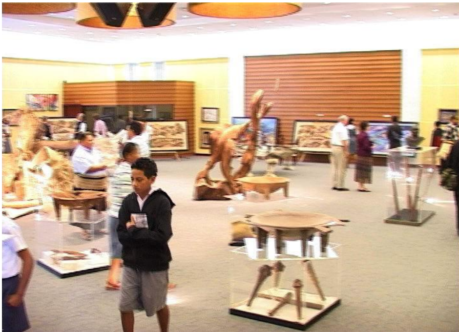
G3: Kava Kuo Heka Exhibitions at Fa'onelua Convention Centre, Nuku'alofa