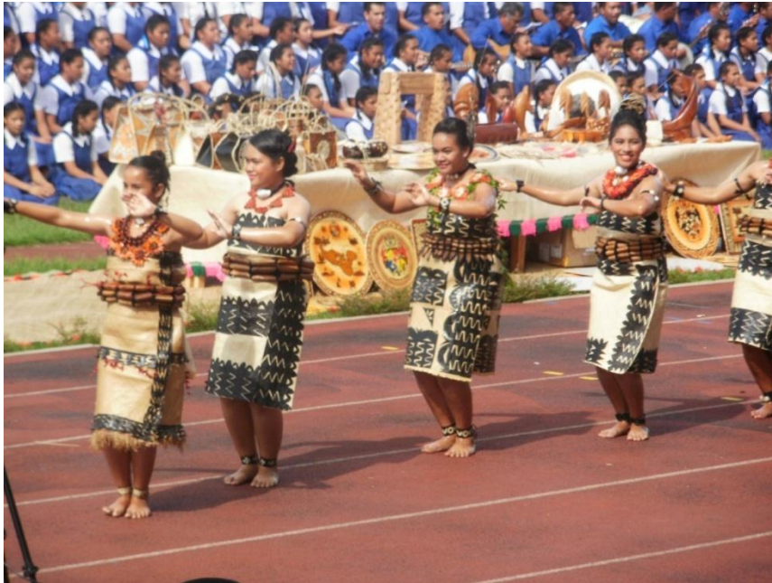
Group dance by students of Queen Salote College, May 2011