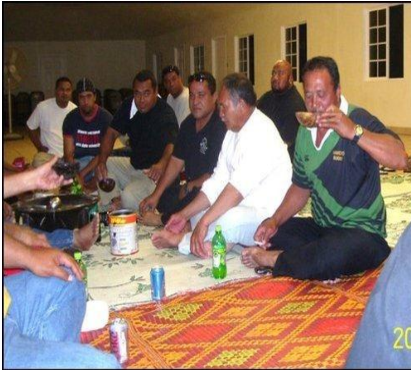
G12: Informal Gathering by men in drinking kava usually to share cultural matters and activities.