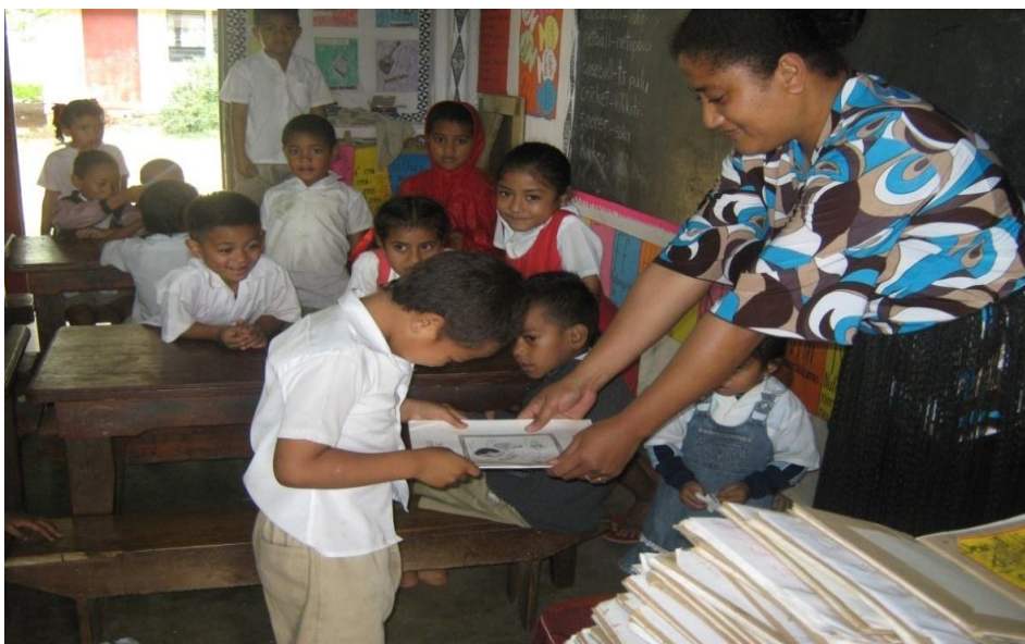
G1: Teacher and student with the new curriculum in primary school.