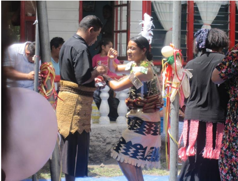
Entertainment during luncheon after ceremonial at church. Taumafa Kava Circle