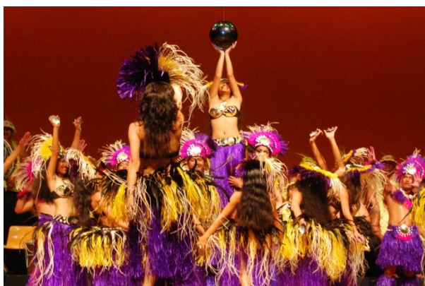
Drum Dance – Manihiki Island