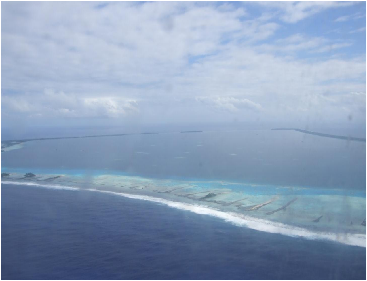
The remote and vulnerable atoll of Manihiki