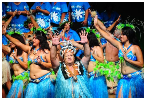
Mangaia Action Song - Te Maeva Nui 2011