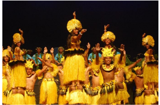
Maue Drum Dance, Te Maeva Nui 2011