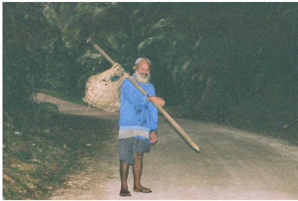
Atiu cultural heritage workshop - Old man just returned from his plantation