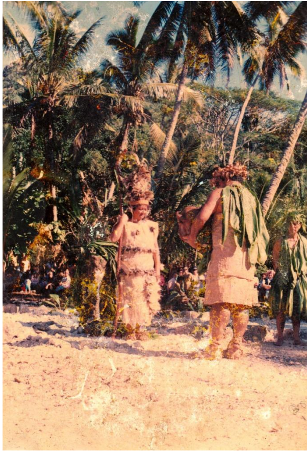
Investiture of Pa Ariki