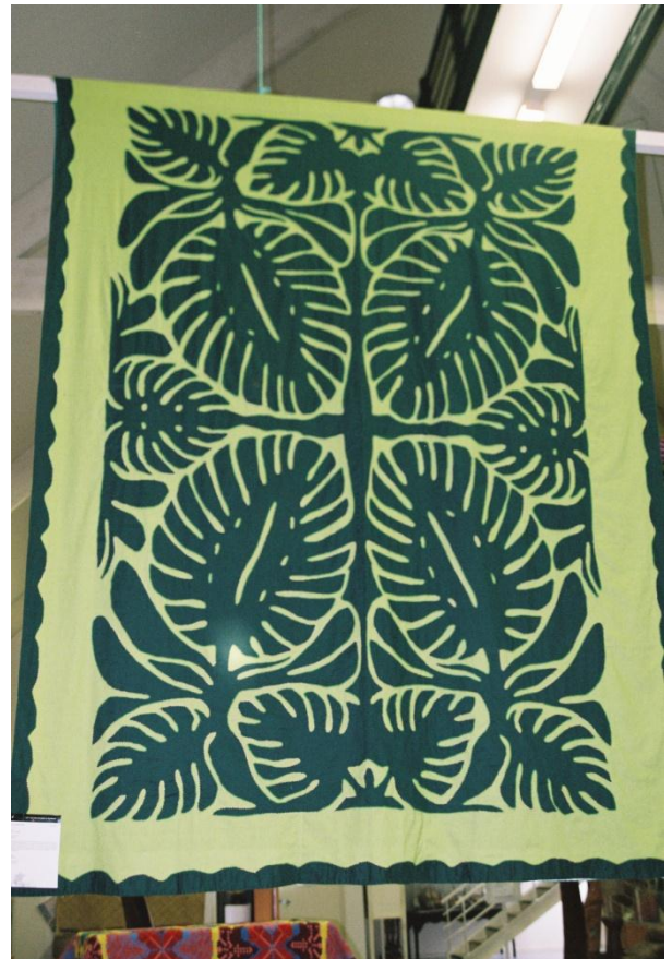
Tivaivai manu - National Museum tivaivai exhibition 2005