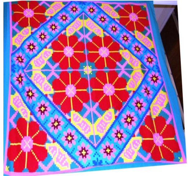
Tivaivai taorei – National Museum tivaivai exhibition (Thousands of tiny square material pieces sewn in the correct sequence to make this beautiful tivaivai taorei)