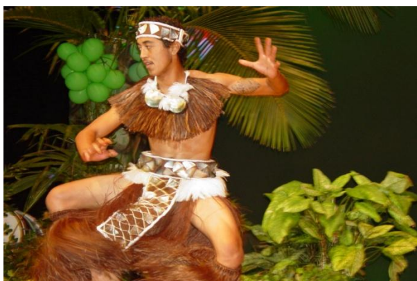
Open male performer from the the island of Rakahanga - Dancer of the Year 2005