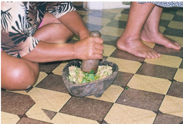
Mangaia cultural heritage workshop 2005 – making traditional medicine. (The practice of making traditional medicine could be protected if the traditional knowledge bill is passed in 2012)