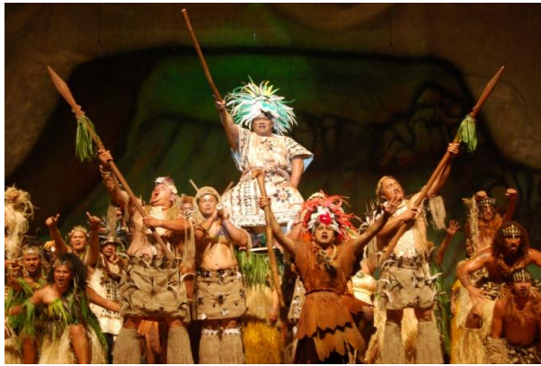
Vaka Puaikura chant - Te Maeva Nui 2011