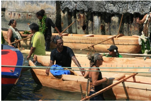
Tarai vaka – testing the vaka