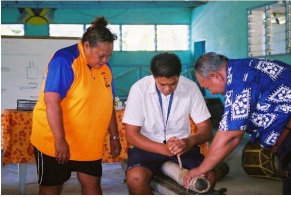
Mauke cultural heritage workshop 2005 - learning how to make fire