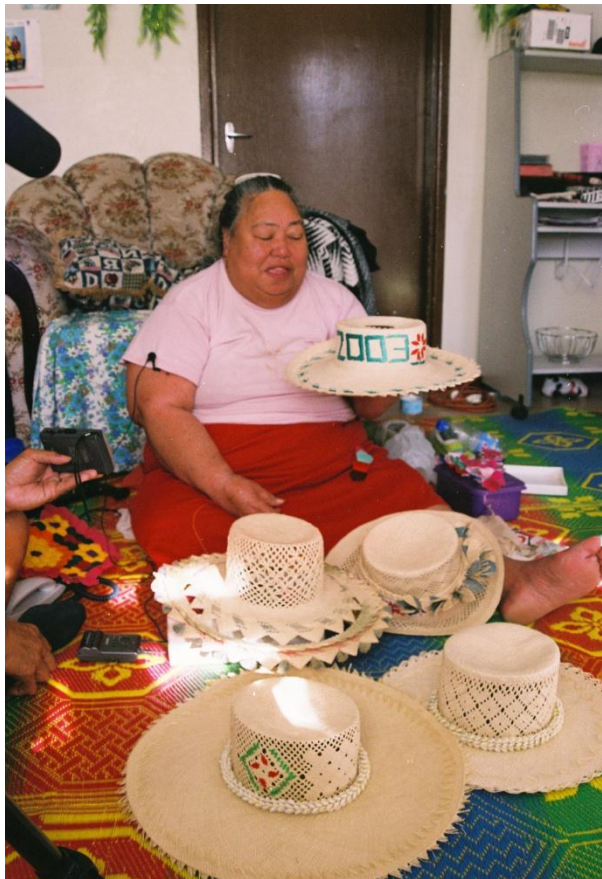
Rito hats made by Cook Islanders living in Australia