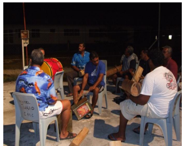
Manihiki Island - Practicing for Te Maeva Nui 2005 (The team travelled to Rarotonga 3 weeks later to attend the festival on a boat trip lasting 3days)