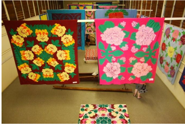
Tivaivai Exhibition - National Museum. (Exhibition is running simultaneously with the tivaivai workshop, photo by Mahiriki Tangaroa)