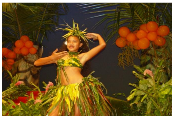
Jnr Girl performer from the island of Atiu - Dancer of the Year 2005