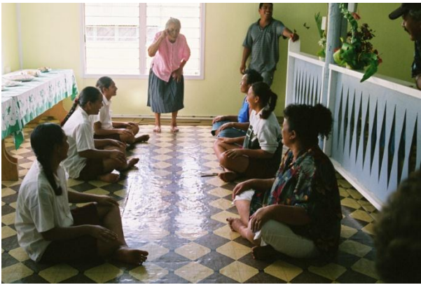
Mangaia workshop 2005 - learning the MIRE