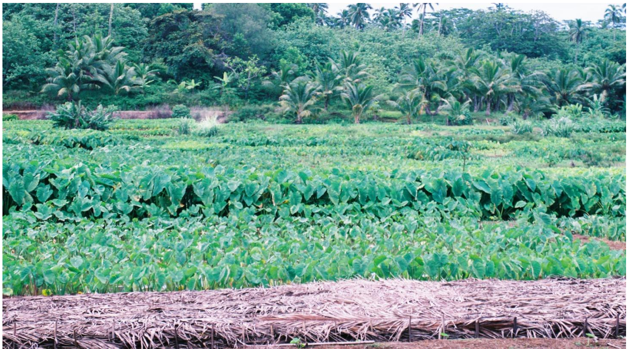
Traditional planting methods on the island of Mangaia. Rauī is applied to land and sea areas