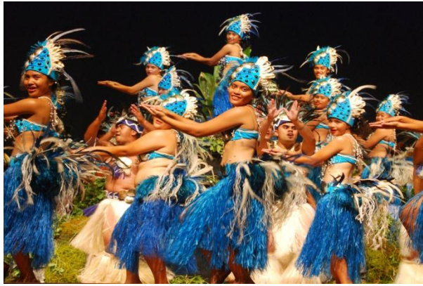
Action Song - Manihik Island. ( Government support should continue for events such a Te Maeva Nui)