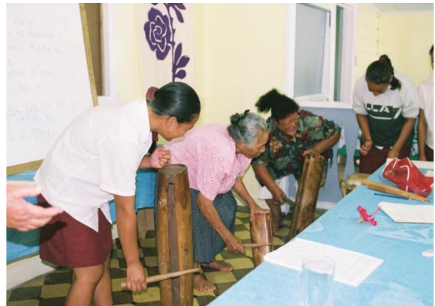
Mangaia Cultural Heritage Workshop 2005, women learning to drum, photo by Ngatuaime Maui)