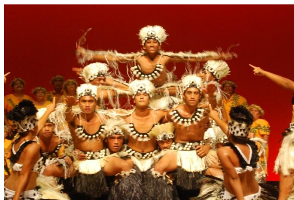
Drum Dance – Aitutaki Island