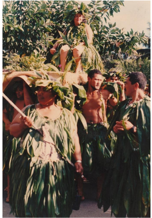
Investiture of Pa Ariki