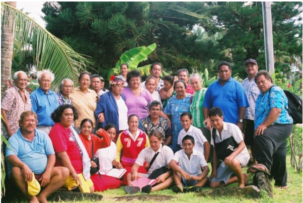
Aitutaki cultural heritage workshop 2005 – participants. (For a well- informed community to safeguard ICH)