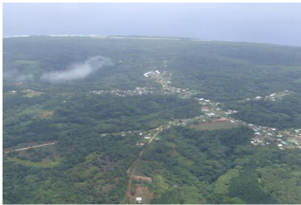
Island of Atiu. (Aerial photograph of this island which has traditional environment practices enshrined in regulations)