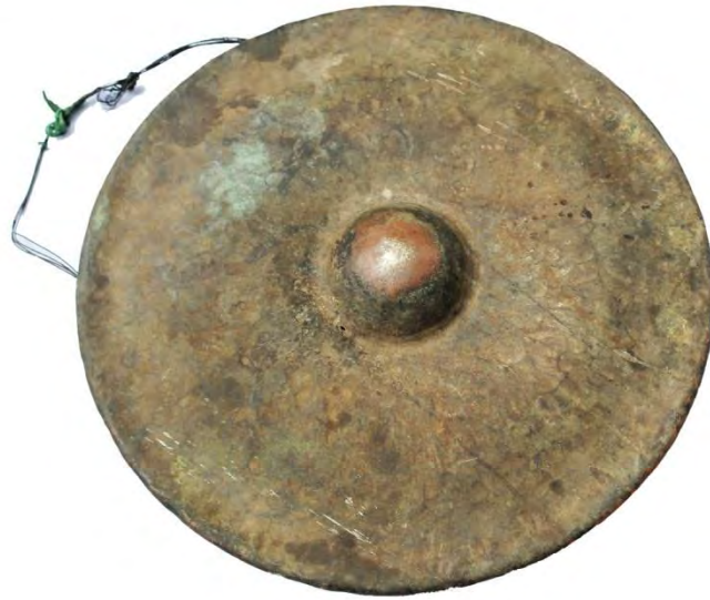
Klat the instrument of gong