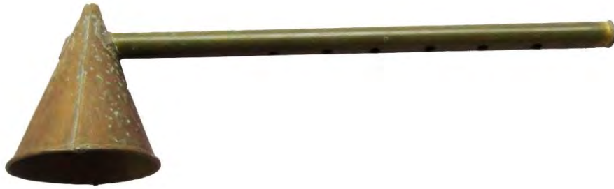
Than Palwei Iron Flute