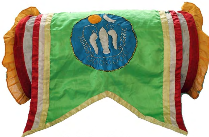
Rakhine Si Taw Rakhine Royal Drum