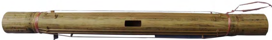
Tee Tine Bamboo Harp