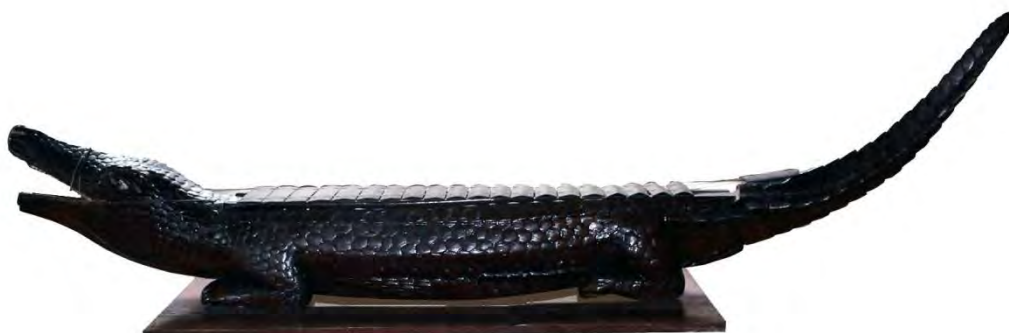
Rakhine Mi Chaung Pa'tala: Crocodile Xylophone