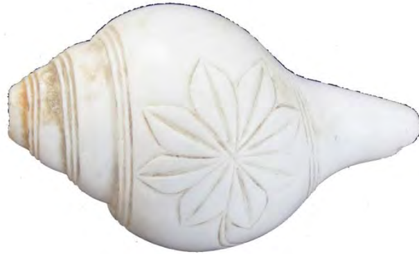
Khaju. Dhin: Conch shell