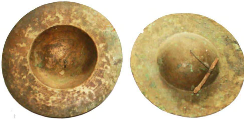
Sout Sa the shape of the brass tray instrument