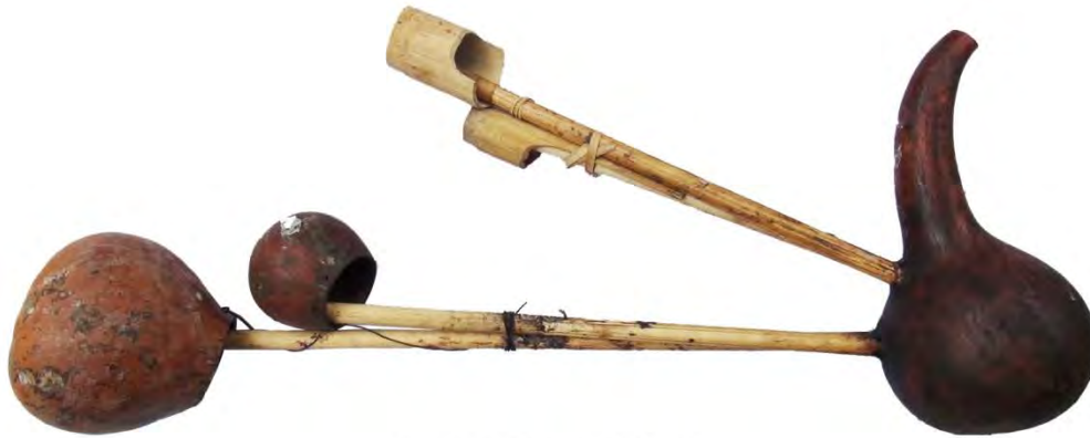
Don DoonDri Kind of wind instrument which is made with bamboo and gourd

1 feet in height of the dried gourd instrument