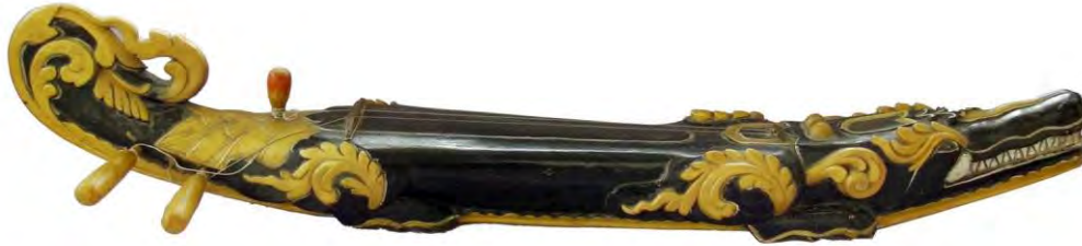
Rakhine Mi Chaung Saun: crocodile Harp