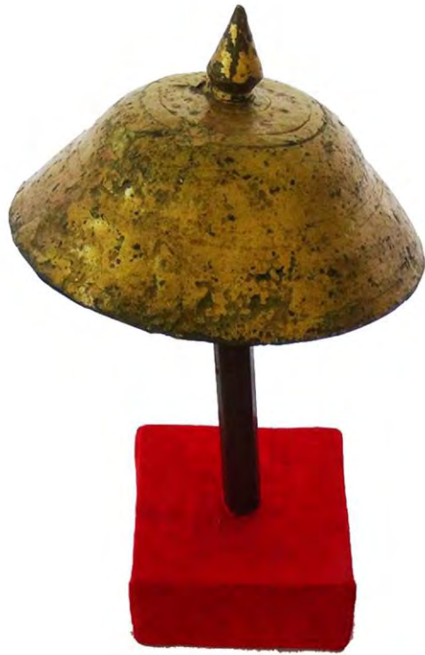
Khwe' Khwin: Timing bell