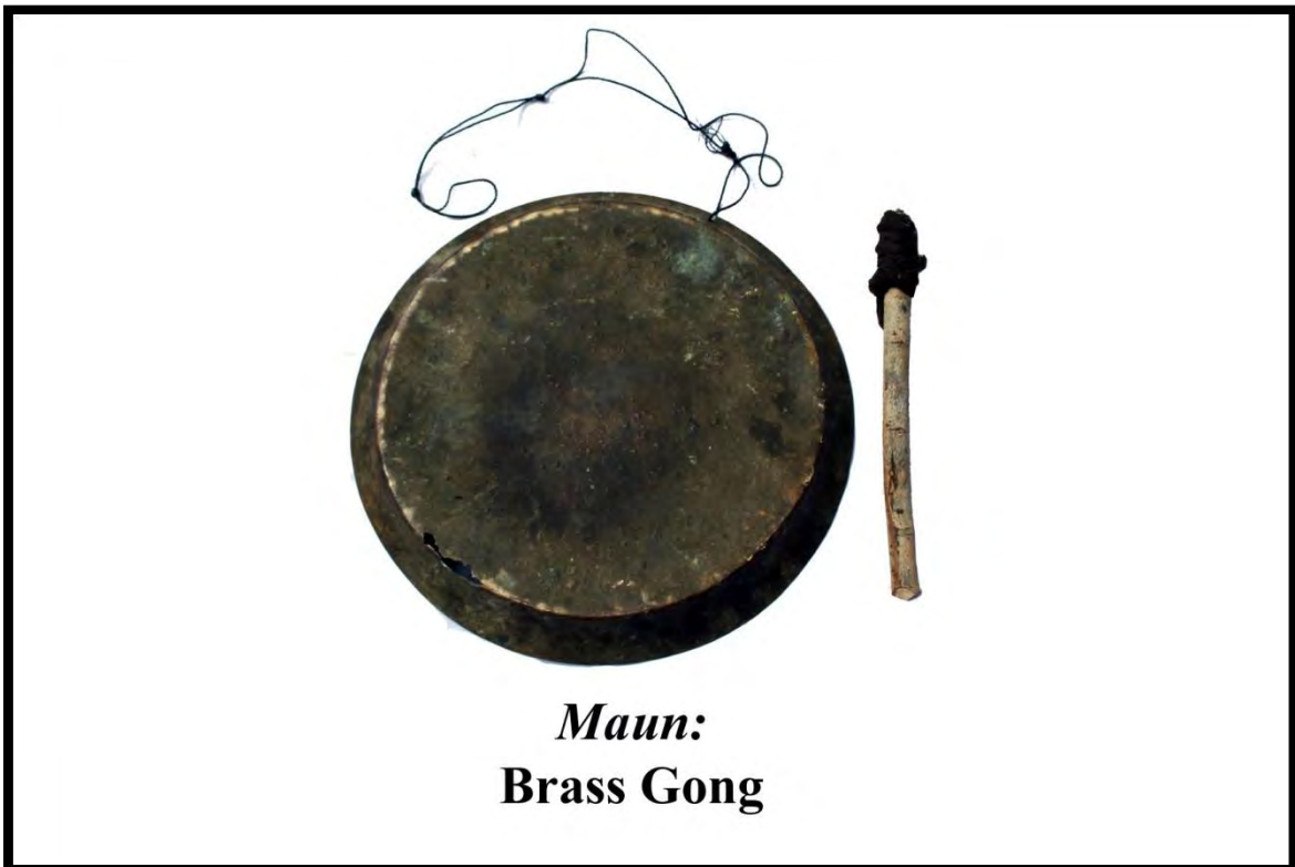
Maun: Brass Gong